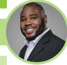
Onome Uwhubetine Development