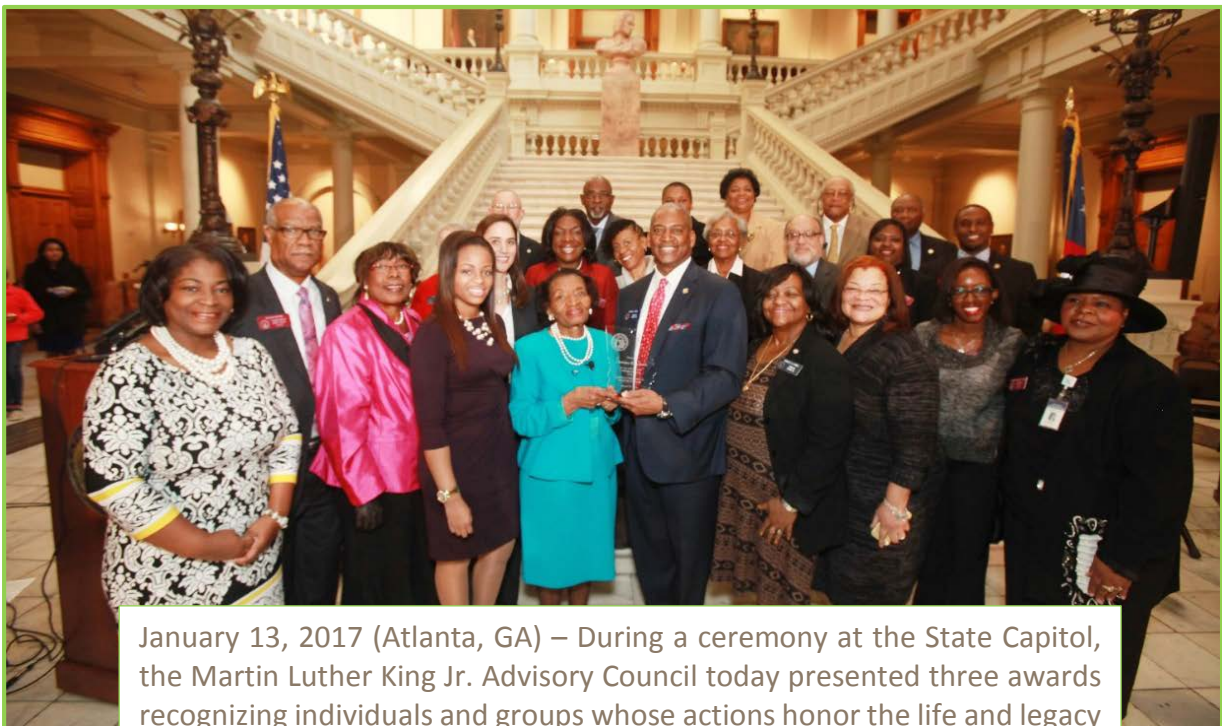
January 13, 2017 (Atlanta, GA) – During a ceremony at the State Capitol, the Martin Luther King Jr. Advisory Council today presented three awards recognizing individuals and groups whose actions honor the life and legacy of Dr. Martin Luther King, Jr. In addition, the Martin Luther King, Jr. Advisory Council is pleased to announce the creation of two new awards that will be given annually in the name of two Civil Rights Legends: Dr. Joseph E. Lowery and Ambassador Andrew Young. These awards will honor individuals.

Supported by the Georgia Commission for Service and Volunteerism at the Georgia Department of Community Affairs, the Martin Luther King, Jr. Advisory Council will promote and plan statewide activities advocating Dr. King’s principles and teachings on MLK Day and beyond.