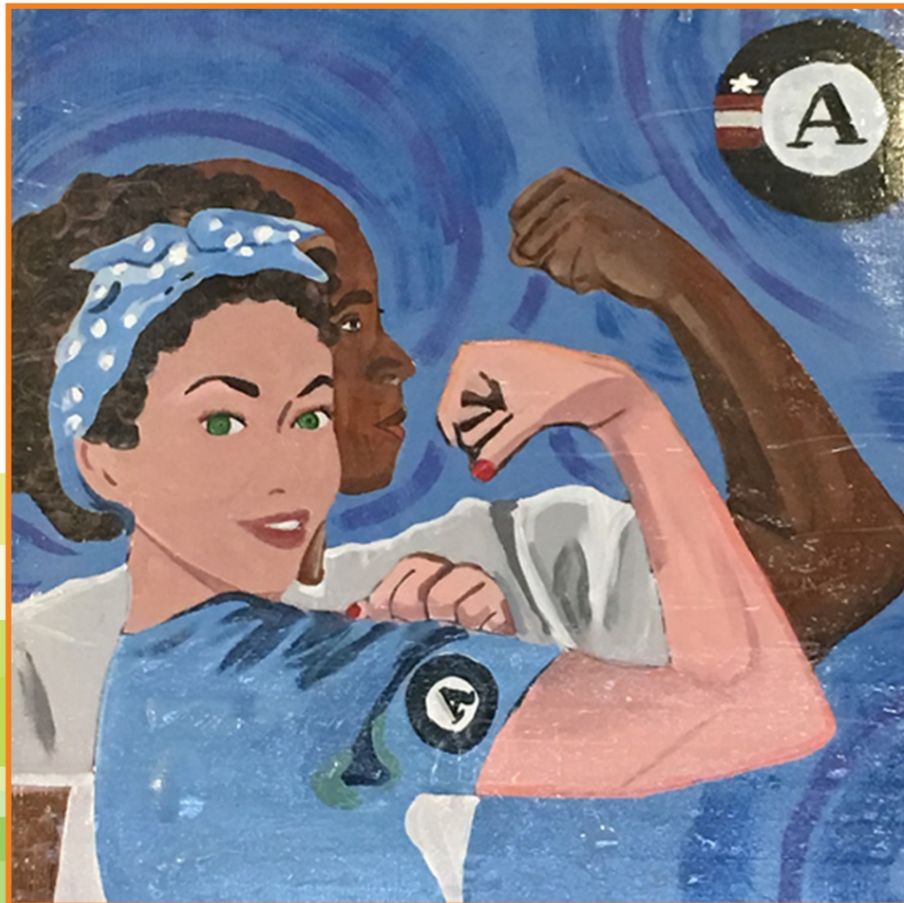
Painting on canvas by AmeriCorps Member of Clayton State University.