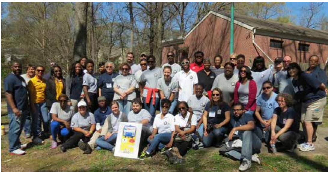
Mayors Day of Recognition Service project at the East Atlanta Kids Club

Over 50 Georgia cities and counties signed on to participate in the 2014 Mayors Day of Recognition for National Service.