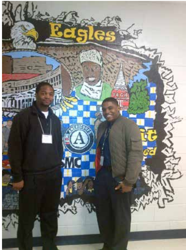
GA Tech CEISMC AmeriCorps Members serving at Best Middle School in Atlanta are standing in front of mural painted in dedication to AmeriCorps' commitment to their students.

Georgia Tech CEISMC (Center for Education Integrating Science, Mathematics, and Computing) Mentoring AmeriCorps program provide mentoring and tutoring in areas of math and science to at-risk youth. Members serve the community by engaging volunteers and students in community service projects. In 2013-2014, 135 students improved mathematical skills with the aid of Georgia Tech AmeriCorps Members. 348 students participated in the program.