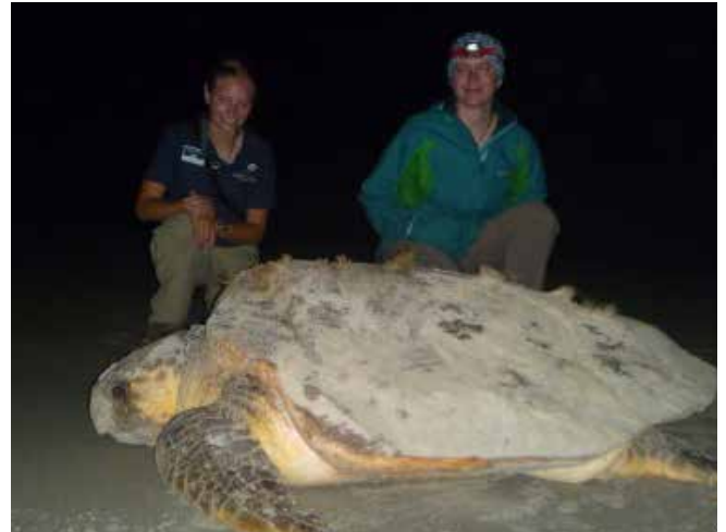
The photo above was taken during a summer night patrol. This female nested on the beach.