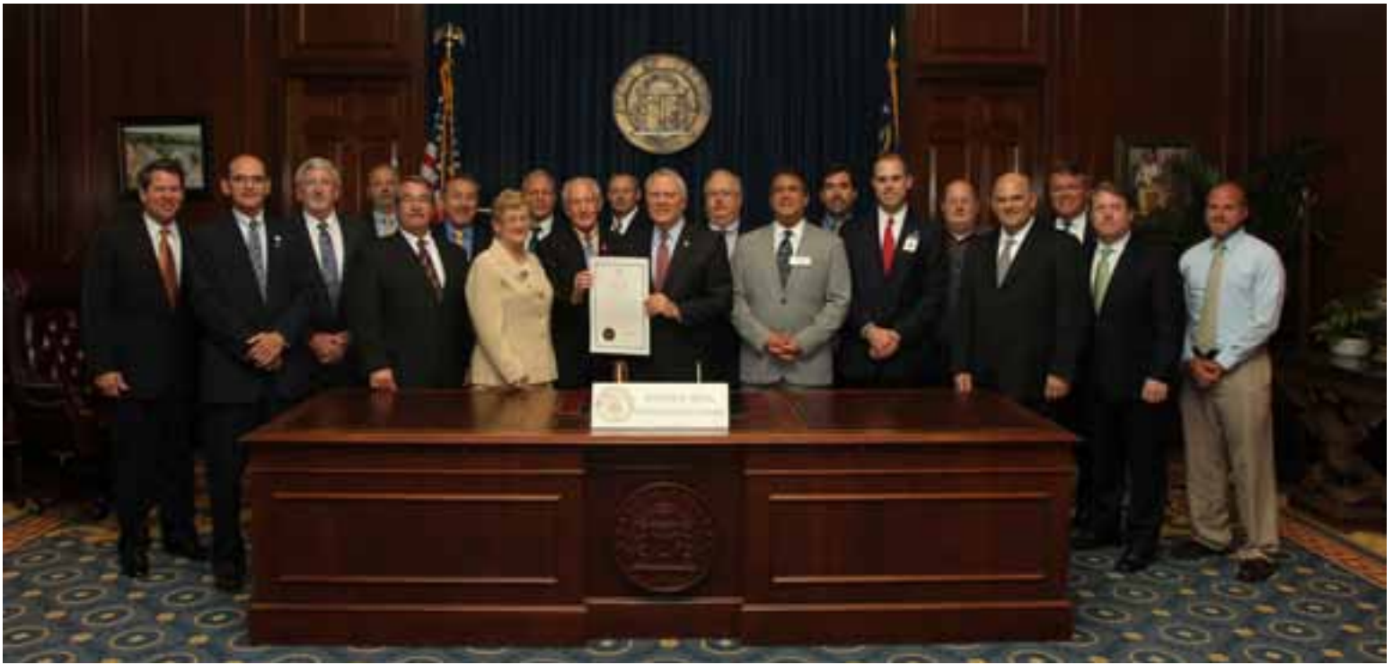
On Thursday, April 25, 2013 Governor Nathan Deal signed a proclamation declaring May 2013 as Building Safety Month in Georgia.