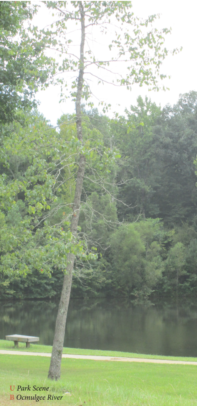
U Park Scene B Ocmulgee River