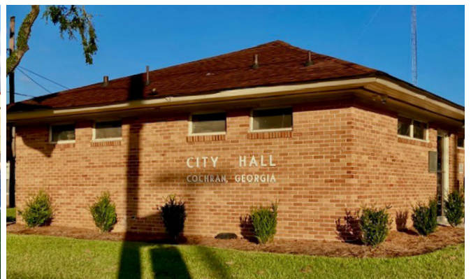
L 1st United Methodist Church R Bleckley County Court House L Bleckley Memorial Hospital R Cochran City Hall