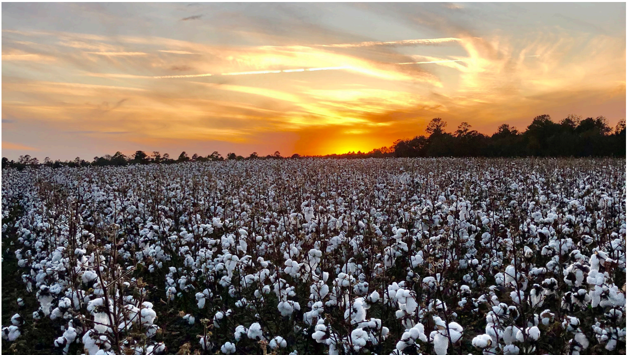
Cotton Field at Harvest, Bleckley County