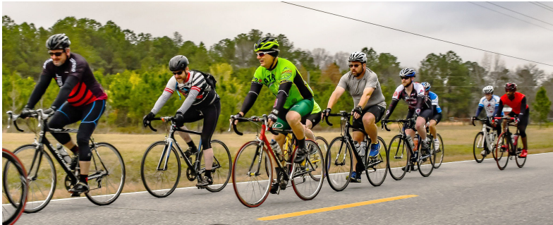
U Paddle in Ocmulgee River B Biking Event in Bleckley County