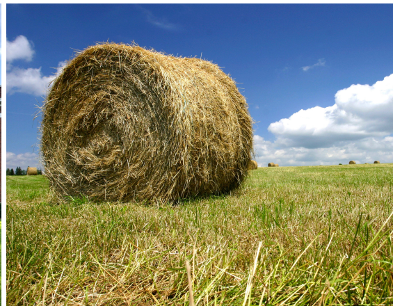
L Cochran Police Department M Bleckley County Court House R Rural Scene, Bleckley County