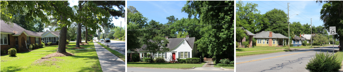
U Bleckley County Health Center B Residential area in Cochran