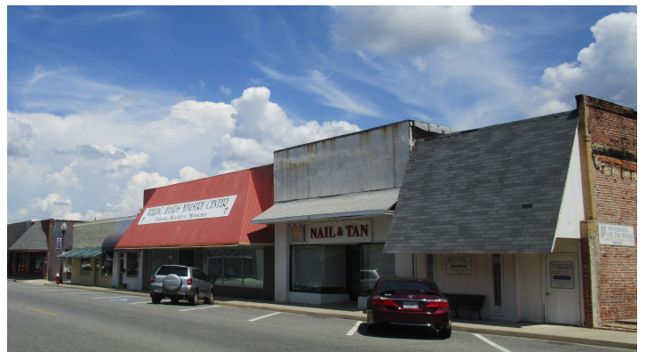
UL Walker Hall UR US Post Office in Cochran BL Ebenezer Hall BR Downtown Cochran