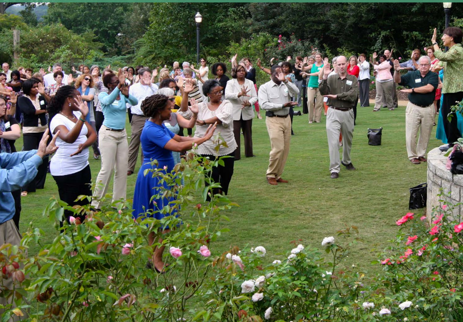
Seniors practice Tai Chi at the Atlanta Botanical Gardens

The design of communities can impact health. For example, access to parks and greenspace improve air quality and promote exercise. The Region's Plan policies seek to better integrate public health impacts into the planning process through public safety, encouraging walking and bicycling, identifying opportunities for local food production and planning for the expansion of green infrastructure.