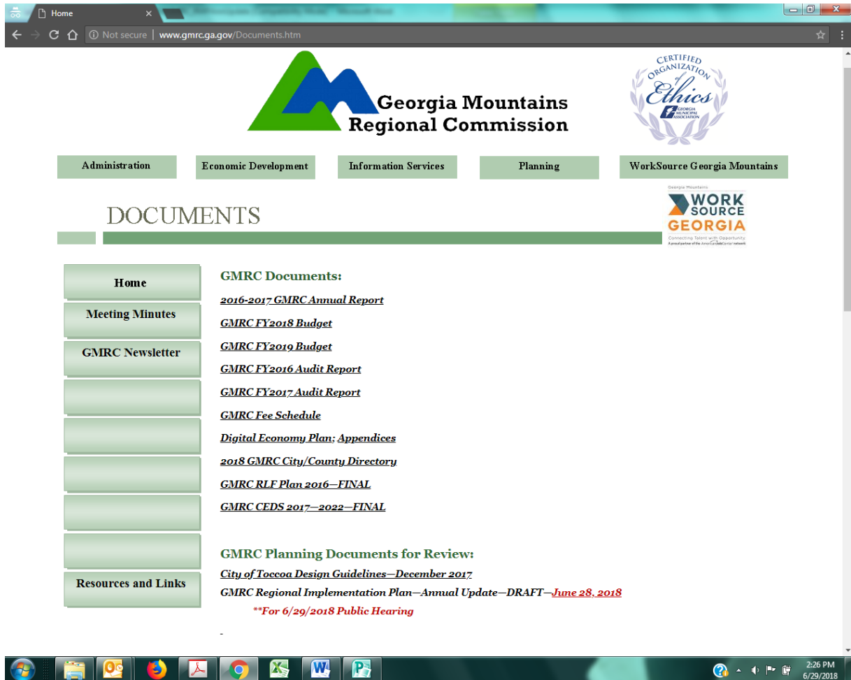
Screen capture of draft document posted on the GMRC web site for public review.