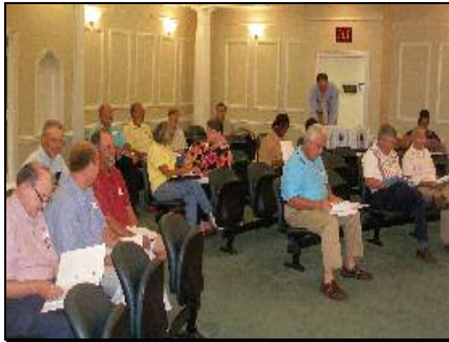
Steering Committee Meeting 6-12-06

Joint Lee County and the Cities of Leesburg and Smithville 2026 Comprehensive Plan