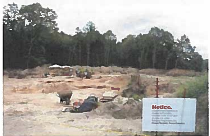
The original burials were located at this site near the Middle Georgia Regional Airport in rural Bibb County.