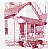
Georgia African American Historic Preservation Network

Restoration of the Wallace Grove School was completed in eight months due to this effort between the Wallace Grove Baptist Church and Morgan County citizens. The restoration celebration also was a homecoming, as former teachers and students arrived to share their memories and photos.