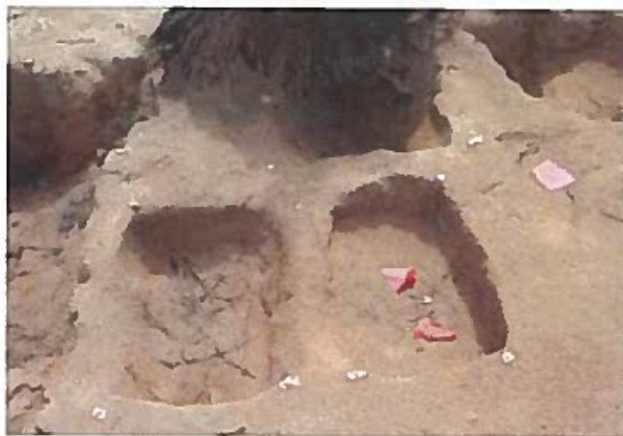
These children were buried next to each other in a family plot at Avondale Place Cemetery.

Diet was also an issue among adults. A high sugar diet combined with only a rudimentary understanding of adequate dental health care resulted in a high incidence of dental infections and cavities. When one's teeth hurt, even less food is consumed. Joint deterioration and arthritis, present even among the middle aged, indicated that physical demands were great; most of the calories an adult consumed would have been burned quickly while keeping up with the daily workload. High physical demand, poor diet, and insufficient volume would have spiraled together to place the adult's health in jeopardy. Add disease and it is little wonder why most