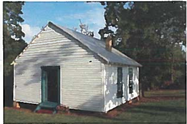
The Wallace Grove School is a one room schoolhouse with six windows that were donated by Franklin Restoration.