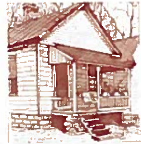
Georgia African American Historic Preservation Network

Since its first issue appeared in December 2000, Reflections has documented hundreds of Georgia's African American historic resources. Now all of these articles are available on the Historic Preservation Division website www.georgiashpo.org . Search for links to your topic by categories: cemeteries, churches, districts, farms, lodges, medical, people, places, schools, and theatres. You can now subscribe to Reflections from the homepage. Reflections is a recipient of a Leadership in History Award from the American Association for State and Local History