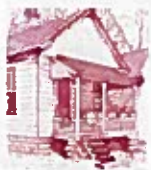
Georgia African American Historic Preservation Network