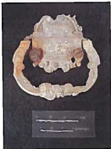
This coffin handle was interred with a child. It was inscribed "the Lord is my shepherd." Photo courtesy of New South Associates, Inc.

Genealogical records were not the only fruitful means of identifying potential descendants. DNA extracted from the bones and teeth of 23 individuals is being compared to DNA provided by potential descendants. By examining DNA stored in a cell's mitochondria the relatedness of female lines can be determined. Researchers have found that several distinct groups of DNA sequences (called haplogroups) from the cemetery exhibit distinct African ancestry. Preliminary results indicate that at least two potential descendants share enough DNA with the Avondale sample to suggest that they are relatives. Continued research on the Y-chromosome is slated to examine whether similar results can be obtained along the male family member lines.