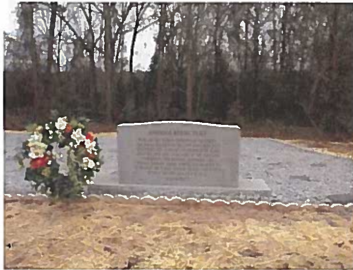
The Avondale Burial Place monument describes the special section in the Bethel AME Church Cemetery where the remains of 101 individuals were relocated.

On February 21, 2012 church and family members gathered to remember those who were briefly lost from history. After dedication prayers were offered by Bethel AME Church pastor, Rev. W. A. Hopkins, flowers were laid on dozens of new graves marking the end of an unusual journey. The remains of 101 individuals originally discovered at the Avondale Burial Place, a largely forgotten cemetery in southern Bibb County, were laid to rest in a specially prepared section of the Bethel AME Church Cemetery.