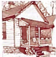
Georgia African American Historic Preservation Network

The Georgia African American Historic Preservation Network (GAAHPN) was established in January 1989. It is composed of representatives from neighborhood organizations and preservation groups. GAAHPN was formed in response to a growing interest in preserving the cultural and built diversity of Georgia's African American heritage. This interest has translated into a number of efforts which emphasize greater recognition of African American culture and contributions to Georgia's history. The GAAHPN Steering Committee plans and implements ways to develop programs that will foster heritage education, neighborhood revitalization, and support community and economic development.