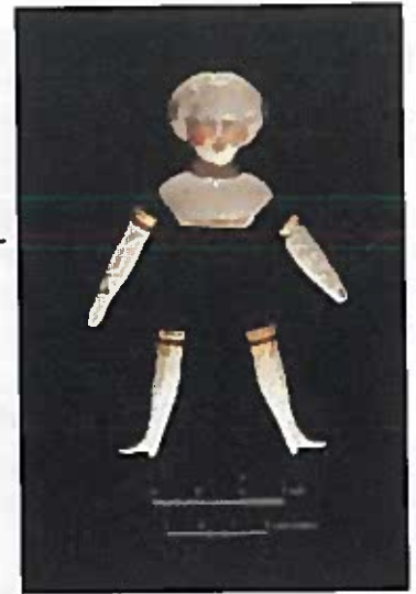
A porcelain doll was found in a child's coffin.

important component of West African cosmology. The hardware on some of the coffins were emblazoned with crosses, lambs, and cross and crown (a.k.a. Crown of glory) motifs, also emphasizing Christian visions of life after death. A black glass pendant with a rose in its center was an indicator that Victorian era mourning ware was probably worn. Personal possessions such as wedding bands, purses, combs, a tobacco pipe, and a porcelain doll were included with some individuals to supply them with objects that they would need in the world of the dead. Among children, a pierced silver coin and bead necklaces probably served as charms. Originally these would have provided good luck and protection from harm; after death they shielded the innocent spirit on its trip to the next world. Coins placed on the eyes helped hold the eyelids shut and provided fare for the spiritual trip.