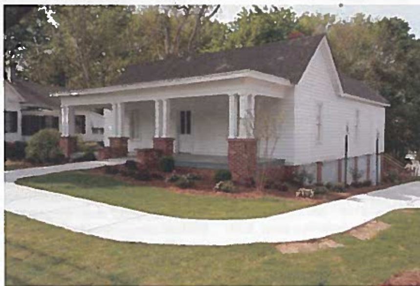
The Sallie Ellis Davis residence is a 1910 Central Hallway house located in Milledgeville. The house is a contributing resource in the Milledgeville Historic District, and was listed in the National Register of Historic Places on June 28, 1972.