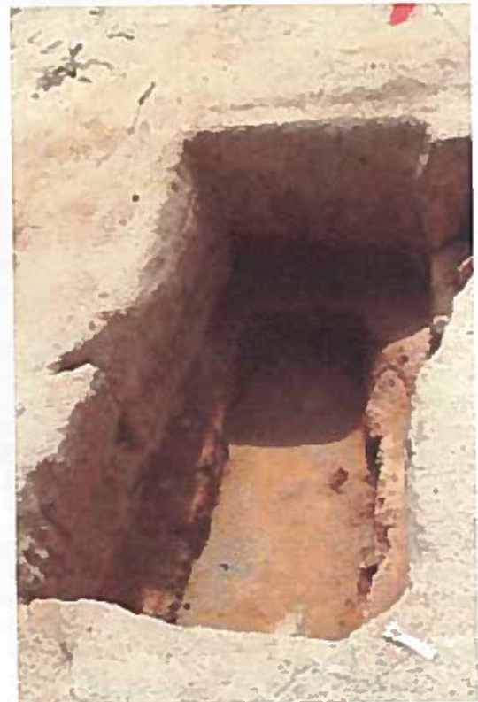
This is an impression from one of the adult graves at Avondale Burial Place Cemetery.