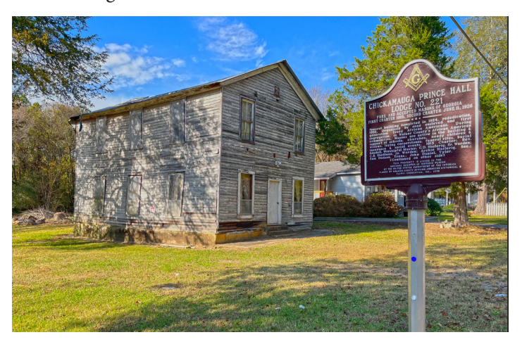
Chickamauga Masonic Lodge No. 221

The Harslerig purchased the land circa 1905 on Hwy. 341 South and Cove Road, reserved for the school and lodge, which some of the Herslerig family attended the school prior to both structures being destroyed by fire for an unknown reason. The current building was completed in 1924, and the lodge's members were community leaders and local Odd Fellows. The lodge was the location for the chartering and meeting of the Walker County African American VFW (Veterans of Foreign Wars) in the 1940s, and a chapter of the Order of the Eastern Star chartered in 1944 as a woman's group, also met there. In need of a new roof and structural evaluation, this lodge no longer has members of its own, but the building is now cared for by local Masons from other regional lodges, and it remains an important space for the African American community in Chickamauga.