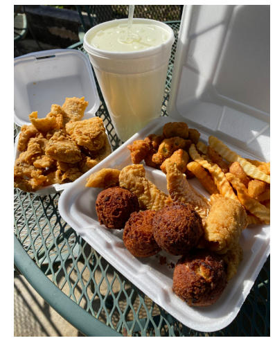
Fried Whitening, Fried Okra, Fries, and Lemonade from Salaam Restaurant

Nigerian acara, made of black-eyed peas, as well as related to Brazilian acaraje, Caribbean acras, and Creole calas.<sup>9</sup> As if the beauty of history isn't tempting enough, come taste a piece of soul food greatness at Salaam's Seafood Restaurant located at 503 E. Broadway St. Griffin, GA 30223.