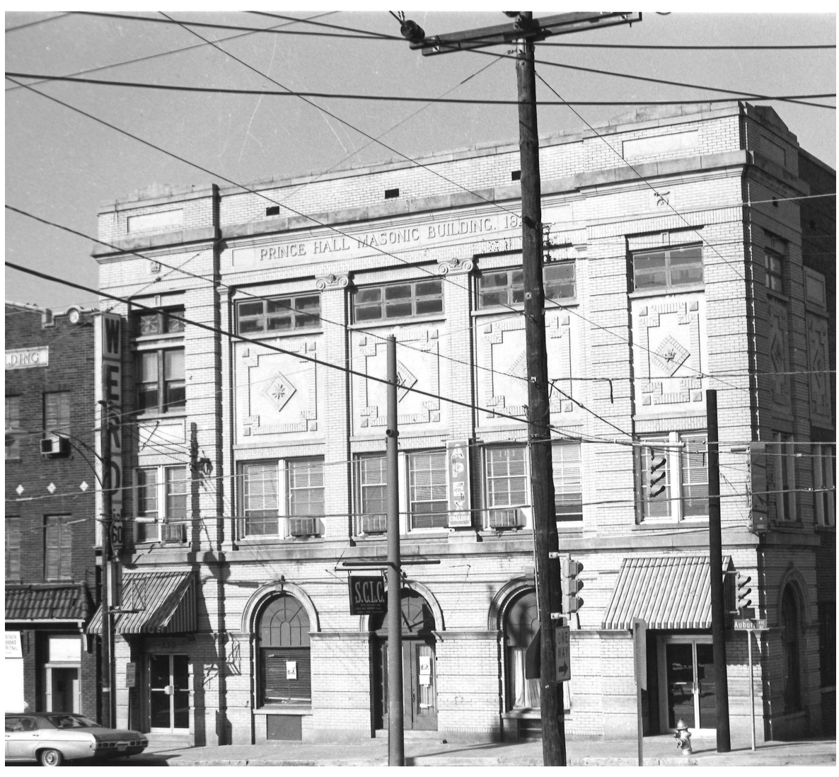
Prince Masonic Hall, now S.C.L.C. Headquarters, 1973.

More small businesses and non-profit organizations are moving into the area with SAW at the helm and the community values in focus. The future looks bright for Auburn Avenue to live up to the "Sweet Auburn" moniker once again.