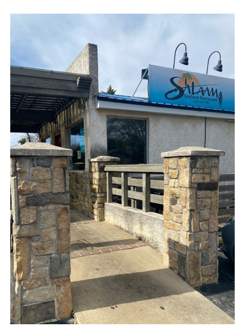
Front Entrance of Salaam's Restaurant

In the middle of a humble small-town street, the savory aroma of freshly fried seafood billows out of a small tannish-white building, adorned with the signage "Salaam Seafood Restaurant." Bustling with customers all eager for a bite, Salaam's is no stranger to a long line of hungry individuals, all patiently waiting for a taste of history. When I arrived, I entered through a modern-deco