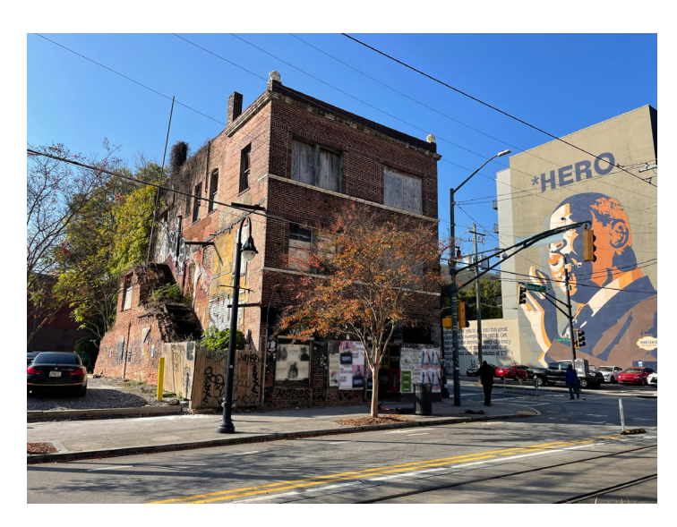
229 Auburn Avenue

A contributing property in the Sweet Auburn Historic District, 229 Auburn Avenue has been home to several African American businesses in the 20th century, including a branch office of the Atlanta Life Insurance Company. Sweet Auburn, located in downtown Atlanta, is a historic African American neighborhood that was one of the largest concentrations of Black businesses during the 20th century. After suffering damage from a tornado in 2008, 229 Auburn has been vacant for years and was identified by the National Park Service as the most imperiled building in Sweet Auburn. Advocates have secured a commitment from the owners to preserve 229 Auburn, and the structure's rehabilitation and sensible reuse are vital to the long-term preservation of Sweet Auburn