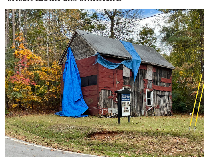
Beulah Grove Lodge No. 372

Douglasville. The building was constructed by Lodge members in 1910, with a schoolroom for the Pleasant Grove Colored School on the ground floor and a Masonic lodge space on the second floor. Lodges played an important role in the African American community. The masons assisted in helping families, churches, and schools to keep the rural community together. The Pleasant Grove Colored school was used by the community from the end of the Civil War to the 1930s. Around the 1970s or early 1980s, the members of the Beulah Grove Lodge #372 ceased meetings because most of the older masons passed away. Later, the Pleasant Grove Baptist Church used the building as an addition to its fellowship hall until 1998. The building, owned by neighboring Pleasant Grove Baptist Church, has not been in regular use for almost four decades and has thus deteriorated.