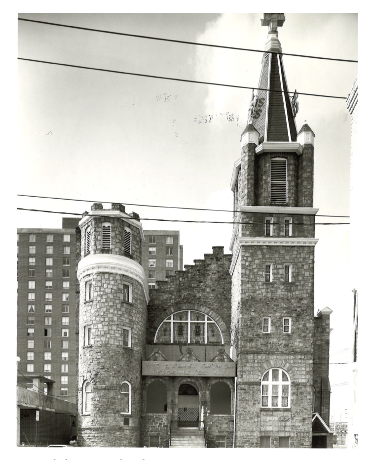
Big Bethel A.M.E. Church, 1973

Designated as a National Historic District in 1974 and a National Historic Landmark in 1976, Auburn Avenue was a lasting example of Black ingenuity and perseverance. However, also by this time, much of Auburn was in dire need of preservation work and repair since the economy of the area changed after the Civil Rights Movement and urban renewal plans in the 1960s.