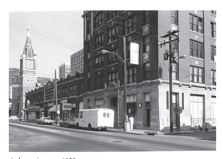
Auburn Avenue, 1973

Auburn Avenue, formerly Wheat Street but renamed in 1893, was located at the heart of the Old