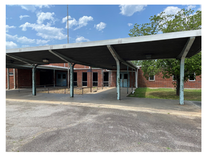
Wilkes County Training School

The Georgia Trust looks forward to working with each of these sites in the coming year and beyond. The Trust continues to support the preservation of Georgia's rich African American communities and historic resources. Through programs such as the Places in Peril, the Trust strives to raise awareness and create opportunities for these projects to successfully preserve Georgia's heritage.