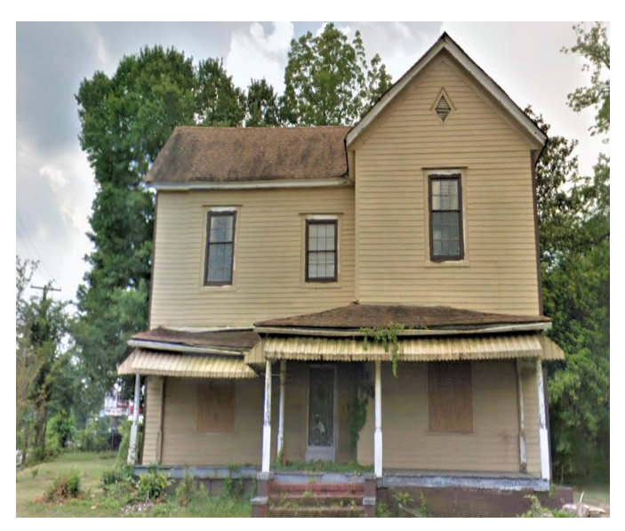
The Isiah T. Epps House, built c. 1905, sits at the corner of Fannin Street and Hamilton Road in LaGrange.

Felecia Thornton Moore, Special Contributor Archives Specialist, the Suber Archives & Special Collections, LaGrange College