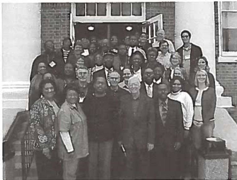
Your Town participants, trainers and staff gather for a photo with Jimmy Carter, 39th President of the United States of America, outside Plains High School. This historic school was restored through a collaboration with the Plains community, the National Park Service, and the One Georgia grant program. It is located in the Jimmy Carter National Historic Site in Plains, Georgia.

Jimmy Carter was four years old, his family purchased a farm in Archery, an unincorporated community a few miles southwest of Plains. Community landmarks in Archery were the Seaboard Air Line Railroad stop, an African Methodist Episcopal (AME) church, and a small store. Approximately 25 African American families and