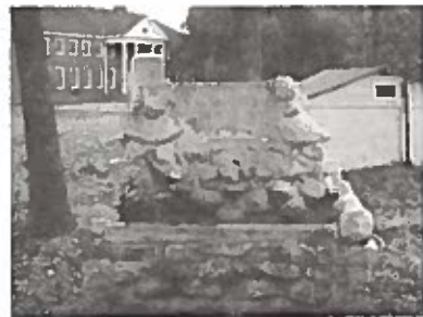
Dorchester Alumni constructed this brick fountain on the campus.

During the next ten years, Dorchester Academy continued to grow, building on a core curriculum of basic education, agricultural and vocational training. By the close of the 19 th century, the Dorchester Academy campus consisted of several wood-framed buildings, including an academic building, chapel, dining hall, grist mill, industrial arts building, and boys' and girls' dormitories. With this expansion, Dorchester Academy became an accredited boarding school. Twelve white instructors taught the students, managed by an all white AMA board. By the 1920s, many former African American students became faculty and board members, and an African American woman, Elizabeth B. Moore, was the principal who continued Dorchester's expansion until her death in 1932. That same year, a fire destroyed the boys' dormitory, and the AMA built the present brick building by 1934, dedicating it to her memory. In 1940, Liberty County opened a public high school for African Americans, and Dorchester Academy closed its doors. All wood-frame buildings were demolished, but the brick boys' dormitory remained. Thus, a new era began for Dorchester Academy, and its legend continued to live on.