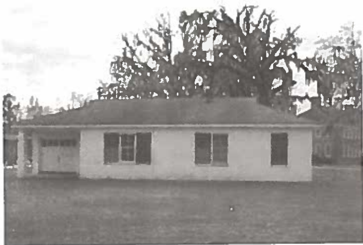
The Claudius Turner Visitors Center, will be used as a starting point for the tour of Elizabeth B. Moore Hall, the former Boys' Dormitory of Dorchester Academy. The center will include a video that depicts the history of Dorchester Academy, and display artifacts, photographs, records, books, and farming tools. A museum shop is planned to market African American historical memorabilia.