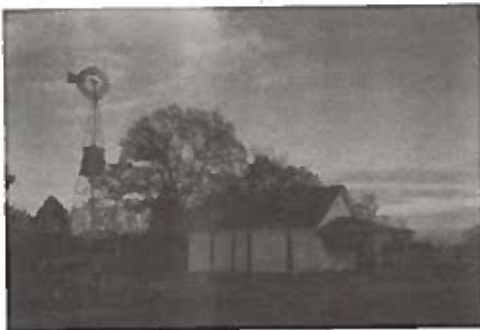
Jimmy Carter grew up on this farm in Archery. His boyhood home and outbuildings are located in the National Historic Site.