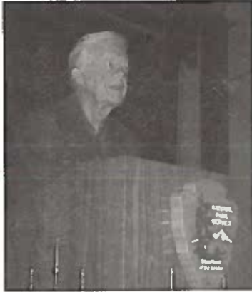
Jimmy Carter shares highlights of his rural experiences from An Hour Before Daylight , his autobiography.