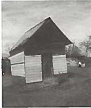
The smokehouse on the Morgan farm features a raised-seam, metal roof, and a log foundation. It was built circa 1890 and used until 1993.