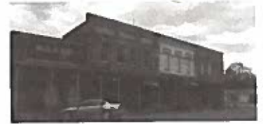
The downtown Plains historic storefronts.