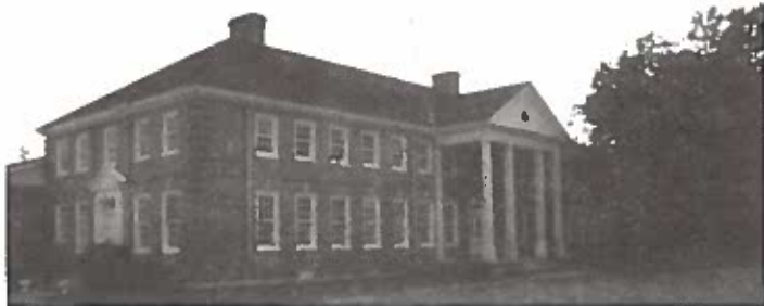
The Dorchester Academy Boys' Dormitory was listed in the National Register of Historic Places on June 23, 1986. This Georgian Revival structure is a rare 20th century example of a rural educational institution built for African Americans by the American Missionary Association.