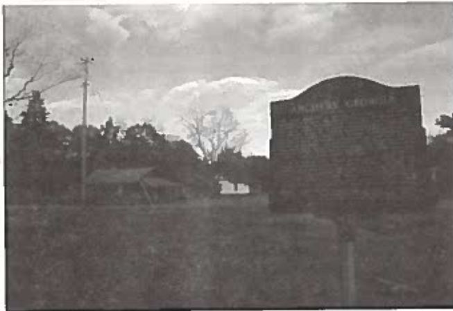
A Georgia historical marker and three small cottages are remnants of the historic community known as Archery.