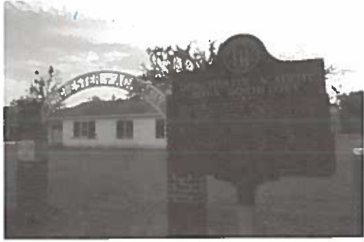
A historical marker and iron gate provide an entrance from the street to the Dorchester Academy campus.