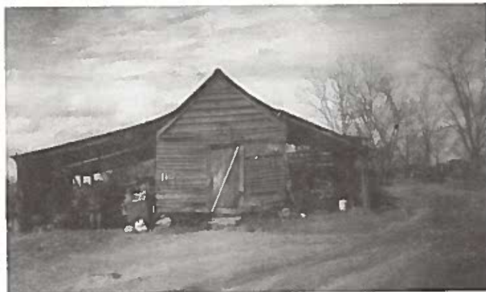
Carranza Morgan adapted the historic cotton barn by adding shed roofs on each side to provide storage for a tractor and other farming equipment.

Carranza Morgan's farm is located on Old Dawson Road in Sumter County, approximately 7.5 miles from Americus. The farm includes a historic farmhouse, six historic outbuildings, and 117 acres of cultivated fields. Carranza Morgan is the grandson of