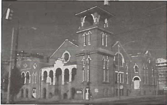
First Congregational Church was founded in 1867 by freedmen and the American Missionary Association. The building was completed in 1908. First Congregational Church was listed in the National Register of Historic Places on January 19, 1979. This historic African American church in downtown Atlanta was designated a landmark by the Atlanta Urban Design Commission on October 23, 1989.

the survey. The current SAC consists of individuals from a variety of backgrounds, who have expertise in a wide range of historic preservation, planning and general design subjects.