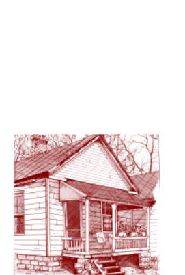
Georgia African American Historic Preservation Network

The Georgia African American Historic Preservation Network (GAAHPN) was established in January 1989. It is composed of representatives from neighborhood organizations and preservation groups. GAAHPN was formed in response to a growing interest in preserving the cultural and built diversity of Georgia's African American heritage. This interest has translated into a number of efforts which emphasize greater recognition of African American culture and contributions to Georgia's history. The GAAHPN Steering Board plans and implements ways to develop programs that will foster heritage education, neighborhood revitalization, and support community and economic development.