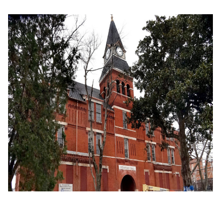
Fountain (Stone) Hall taken 2021.

Fountain Hall, a National Landmark, designated in 1976, is the iconic emblem of "dear ole Morris Brown" and a testament to the American Civil Rights fight for equal education for all. Built in 1882, the 39,000 square-footstructure was the third building of the then-Atlanta University (now Clark Atlanta University, CAU) offering Kindergarten-to-College curriculum for blacks and white children. The three original AU buildings were deeded to MBC by for educational use, with a revisory clause to return to AU if Morris Brown College ever closed.