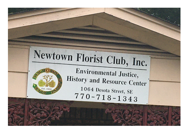
Sign at the local Social/Environmental organization's headquarters

Companies like Purina Mills, Cargill and Land O' Lakes Purina, from 2002 to 2017, were fined less than $22,000 by the Environmental Protection Division (EPD) for various violations related to air quality at their locations in the Newtown area.<sup>11</sup> During the 1990s Black communities like Newtown were fighting for environmental justice and relied on the hard work of Black women who used culture to empower the community.<sup>12</sup> The advocacy work of the women even reached the children who attended the programs and the youth who were mentored to participate in the women's advocacy work, as recalled by Rev. Johnson. When she joined the Club and began earning about the social issues, Johnson and other students her age attended and spoke at public meetings and helped to carry out campaigns. She reflected on 70 years of community work that strategically included partners such as National Council of Churches, Racial Justice Group, academic researchers at Vanderbilt University and University of Georgia, and a host of other local groups and individuals. Newtown Florist Club created "teachable moments" on the "toxic tours" organized and led by Newtown Florist Club. Members such as Mrs. Bush and others addressed soil contamination, toxic air pollution, noise pollution and documented its long-term impact on children and adults who were disproportionately diagnosed with cancers and lupus.13