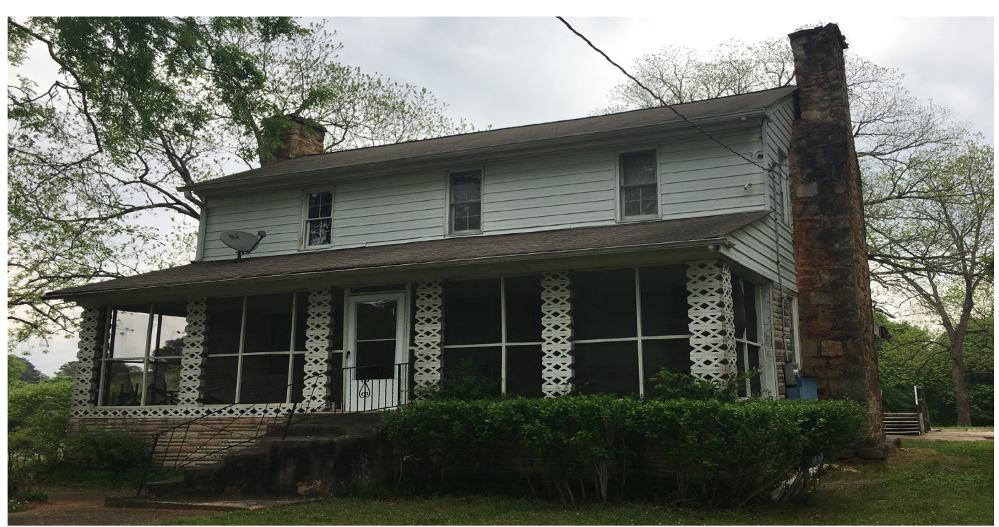
Modern changes to the Maguire-Livesey House, also known as "the Big House", chronical its evolutions as a farm homestead.

A drive through the Promised Land today will not reveal it to be particularly different from most other neighborhoods. That, in and of itself, lends credence to the idea that Black history is American history. This seemingly ordianary American community stands as evidence to African contributions, to African American enterpreneurship, and to human achievement--all despite hostile oppression. The Promise Land in Gwinnett County is a clear testament to the importance of historic preservation of resources both above and below grounds as a means of honoring this legacy in our lives today.