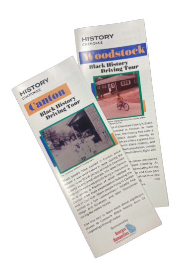
Brochures from the project.

Stops on the Cherokee County Black History Tour include, from top: The Magnolia Thomas Site, recreation of the original home; The North Georgia Fire Station; and the Cherokee County Training School, 1953.