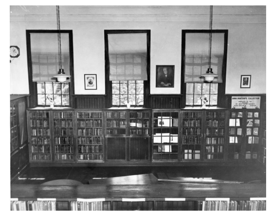
Negro history collection.

Many people who integrated libraries in the South are unsung heroes. They never made front page news, they only wanted to be able to read. Public libraries allowed a new generation of African Americans to grow up with access to things that their parents had only dreamed of. Driven by their own will for more resources and opportunities, public library demonstrations marked the beginning of a still ongoing fight for equal access for all.