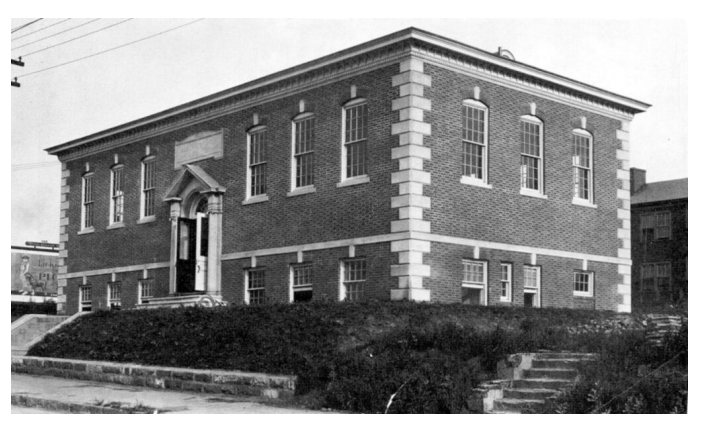
Auburn Avenue branch of the Carnegie Library.

by Victoria Larcheveaux, Curator, Troup County Archives and Legacy Museum