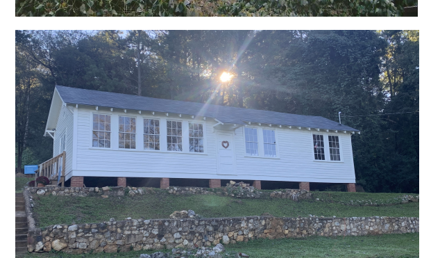
Before and after: The Fairview School project in Floyd County rehabilitated as of 2022.

To qualify to become a CLG in Georgia, a city, town, or county must pass a local preservation ordinance and create a historic preservation commission consisting of at least three members. The commission must adhere to federal preservation standards and must survey and inventory their historical properties on a regular basis. The Georgia Historic Preservation Division (HPD) assesses the performance of a CLG once every four calendar years. Some of the many benefits of becoming a CLG, besides grant eligibility, are the ability to more closely partake in the National Register (NR)