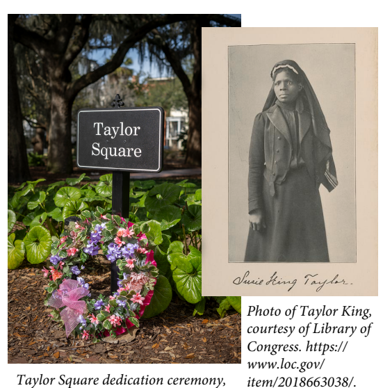
Taylor Square dedication ceremony, February 2024.

In 2021, the group focused on new names for the squares that would honor the history of Savannah's Black community. Suggestions included "Sankofa" and "Jubilee" square. But the democratic process for changing the name of a historic square had to be approved by the Savannah City Council and it would require at least fifty-one per cent agreement of residents living in the areas around the squares. For more than two years, the group worked tirelessly with the help of some coalition partners and council members knocking on doors and securing signatures on a Change.org petition. The process also included public comment periods, public engagement, and hearings. And there were at least fifteen names suggested including historic and contemporary personalities, such as preservationists and educators. On August 24, 2023,