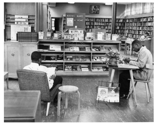
West Hunter branch of Atlanta Library.

The original plans for the building called not only for a library, but a community center as well. By 1925, the Sweet Auburn Center was functioning as just that. The Carnegie segregated libraries offered African Americans a place to read in their own safe space, not simply crammed into a "Negro reading room" in the damp basement of a white library. Libraries built and funded like those under the Carnegie name became a sort of start for the Civil Rights Movement long before the thoughts of schools and buses.<sup>3</sup>