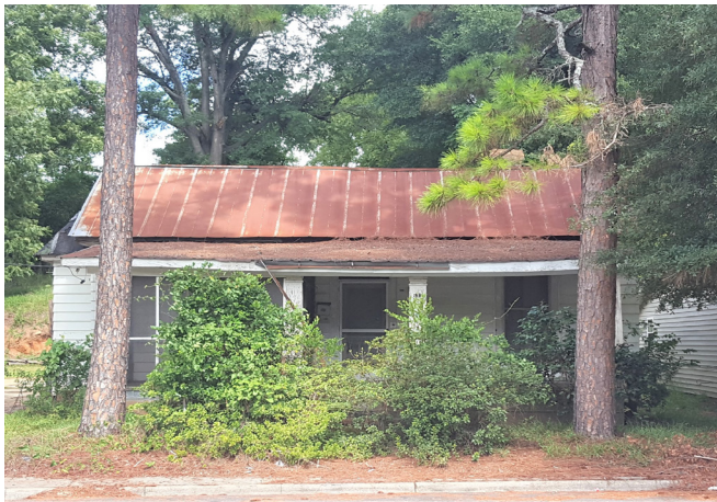
The Lewis House, Oglethorpe Avenue, Americus. Taken August 2019.