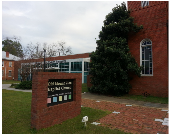
Old Mt Zion Baptist Church and the Albany Civil Right Institute rest in the Harlem neighborhood. Both sites are also on Georgia's Footsteps of Dr. Martin Luther King Jr. Trail https://www.exploregeorgia.org/itinerary/georgias-footsteps-of-dr-martin-luther-king-jr-trail

Between the late 1990s and mid-2000s, many other businesses in Harlem closed. The area became dominated by vacant lots and empty storefronts. However, members of SOWEGA Rising coalition hope to create an "urban revival" to change that.