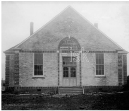
Griffin Vocational School, circa 1929

As the railroad shaped the city, Griffin School is considered the glue that holds the Fairmont neighborhood together. It is a Rosenwald school built in 1929 for Black students in Griffin. 12 “The ‘Griffin Vocational School’ is evidence of an era when African Americans desired quality vocational and educational experiences for their