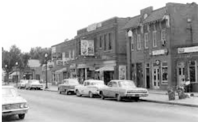
The Ritz Theate, in the center of the block, circa 1960.

The Ritz Theater was built with few theatrical amenities, a shortcoming that was in part addressed by the construction of the Cultural Center. Without the Cultural Center, revitalization of the Ritz would be impossible. Opponents to the City's plan argued that demolition of the Culture Center would sentence the Ritz to a slow death.