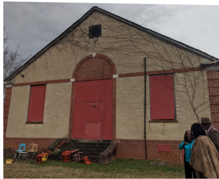
Alumni meet at Griffin School April 2020