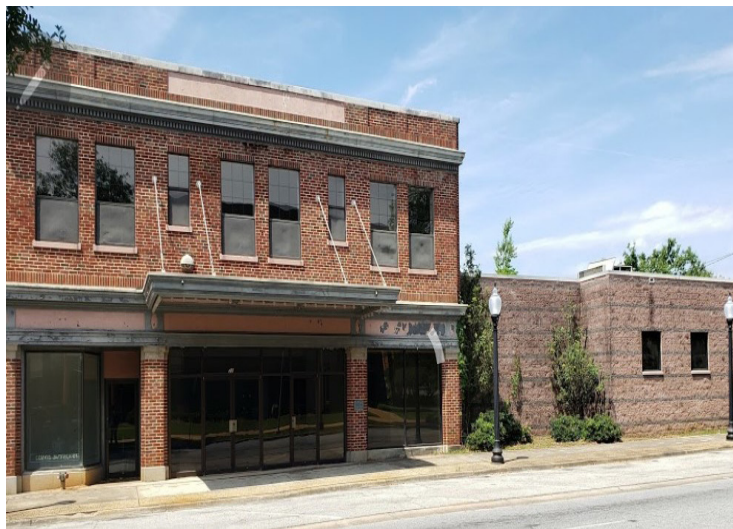
The Ritz Theater (left), built in 1930 and its Cultural Center added in 1991 composes the last, intact block of the Harlem Business District. Photo taken April 2020.

people relied on for safe places to shop in the deeply segregated Jim Crow south. The Harlem Business District also boasted a Black-owned hotel, beauty supply store, and four tourist homes (today called bed and breakfast inns) that were listed in the Negro Motorist Green Book. 2