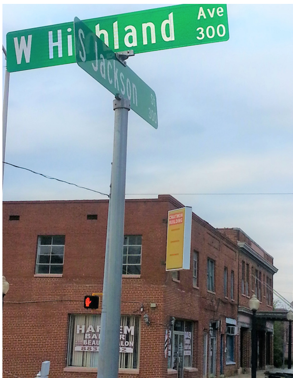
The Chatmon Building shares the block with the Ritz Theater and houses the last few Black business in this once-bustling business district.

SOWEGA Rising launched the "SAVE THE RITZ! SAVE HARLEM!" campaign. The grassroots organization leveraged social media to mobilize people around the proposed demolition for the transportation center. An online petition opposing the demolition of the Ritz Cultural Center garnered over 600 signers and members of SOWEGA Rising were able to meet with federal, state and local leaders to advocate for the Ritz Cultural Center.