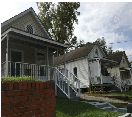
207, 209, and 211 Ashby Street, Americus

The storehouse originally sat at the edge of the property line near the streets of Ashby and Lee. The vernacular building was moved back 20 feet in 1987 for a public street widening and drainage project. 9 Today, the historic store houses a barbershop and a take-out restaurant. ■