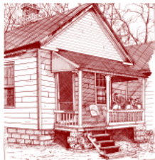
Georgia African American Historic Preservation Network

The Georgia African American Historic Preservation Network (GAAHPN) was established in January 1989. It is composed of representatives from neighborhood organizations and preservation groups. GAAHPN was formed in response to a growing interest in preserving the cultural and built diversity of Georgia's African American heritage. This interest has translated into a number of efforts which emphasize greater recognition of African American culture and contributions to Georgia's history. The GAAHPN Steering Committee plans and implements ways to develop programs that will foster heritage education, neighborhood revitalization, and support community and economic development.