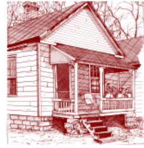
Georgia African American Historic Preservation Network

Since its first issue appeared in December 2000, Reflections has documented hundreds of Georgia's African American historic resources. Now all of these articles are available on the Historic Preservation Division website www.georgiashpo.org . Search for links to your topic by categories: cemeteries, churches, districts, farms, lodges, medical, people, places, schools, and theatres. You can now subscribe to Reflections from the homepage. Reflections is a recipient of a Leadership in History Award from the American Association for State and Local History.