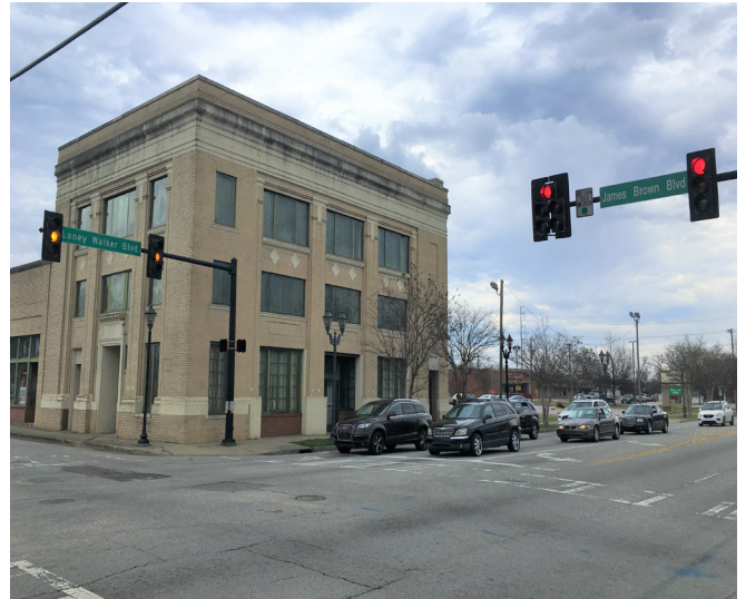
After dispersing from the Municipal Building, demonstrators reconvened at this corner and began targeted acts of protest.

throwing objects at passing white motorists. Reassembling on Gwinnett Street in the heart of the black community, protestors ransacked white- and Chinese-owned stores known to exploit black customers. As night fell, they began targeted acts of arson. The protest spread across a hundred-block area and destroyed 67 businesses, about $1 million of property. 6