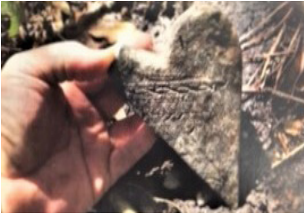
Marble headstone fragment uncovered during site survey.

This study of Coldbrook Plantation aims to better understand inland rice lifestyle in a broader context in Georgia. While there have been some archeological investigations and interpretations of inland rice cultivation in our neighboring state to the north, it has been quiet here in Georgia. There are many questions related to this site such as how did rice production at Coldbrook differ from tidal systems on the coast, and how did the lives of those enslaved Africans differ when toiling on inland rice plantations. We also would like to know what other cultivars were grown at Coldbrook and what archeological evidence of the rice varieties might exist.