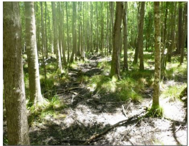
View of a quarter ditch (center) from the raised causeway.

Systematic shovel testing, surface collection, and ground penetrating radar (GPR) surveys were performed in compliance with Section 106 of National Historic Preservation Act, which mandates the identification and evaluation of historic properties before such project can receive their federal permits. The proposed Effingham Parkway project entails the construction of a 6.36 mile, two-lane roadway from State Route (SR) 30 to Blue Jay Road in Effingham County, Georgia.