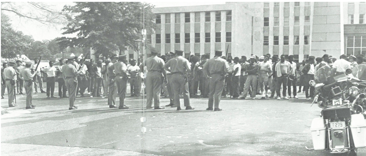
The two-day protest was captured in the Augusta College White Columns Yearbook that year.

equality and justice realities in their city as a new decade dawned. Whites had a stranglehold on almost every elected office and actively sought to maintain the system of white supremacy—segregated and unequal public schools, new industrial jobs for whites, entrenched residential segregation. Undergirding this was pervasive police brutality: black people would simply go missing, white officers would randomly arrest black citizens (especially teenage boys), and harassment by police was routine. 1970 Augusta was “in the throes of American apartheid,” a veteran activist reflects. 1