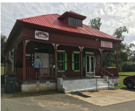
Dismuke Storehouse. built 1899