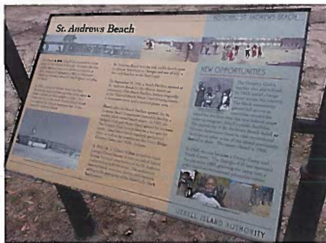
Educational panels stand throughout the former Dolphin site.

St. Andrews Beach is also the site of the 1858 landing of the illegal slaveship, The Wanderer . Reports