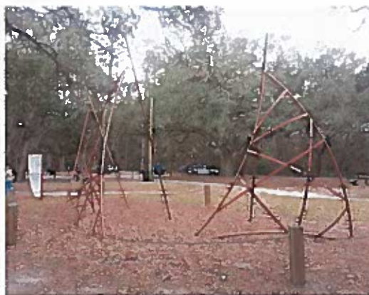
The Wanderer Memorial was installed in 2008

St. Andrews holds important stories of both the Africans brought to Jekyll Island, and of their descendants who continued the fight for freedom. ■