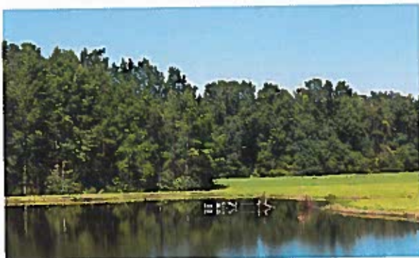
Good fishing is abundant on the lake that divides the agricultural fields on the farm.