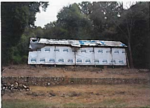
The last surviving building from the circa 1920 Fairview campus is the focus of current preservation initiatives. The Fairview-E.S. Brown Heritage Corporation sponsored a gala for the school's 90th anniversary.