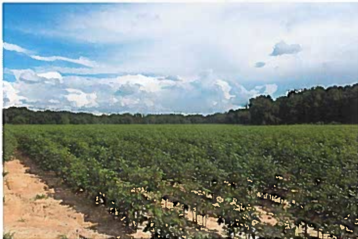
Rows of cotton can be seen on the Titus Stephens Farm that is located off County Line Road in Dougherty County.