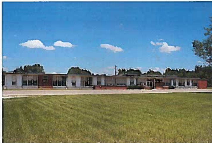
The 1954 Willow Hill School was saved by alumni who purchased it at auction. Today, the building is known as the Willow Hill Heritage and Renaissance Center.

Equalization schools, built from the 1950s to 1970, represented the first period in African American education in Georgia when public schools were financed through the State School Building Authority. The buildings were part of a strategy to respond to the integration directive by running