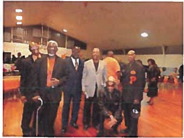
Some of the players from the 1963 state championship team wore their team letters and jackets at the 50th anniversary banquet.