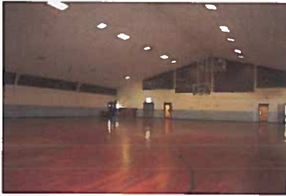
The Valdosta City School District maintains the Pinevale gym that is still in use today.

gymnasium floor is ideal for basketball games, has bleachers and is air conditioned. Alumni were encouraged to develop mentoring programs while continuing the gym's primary use: recreation. Alumni were excited about an upcoming reunion, one that would commemorate how their football team won the 1963 state championship in the segregated A4-A Division.