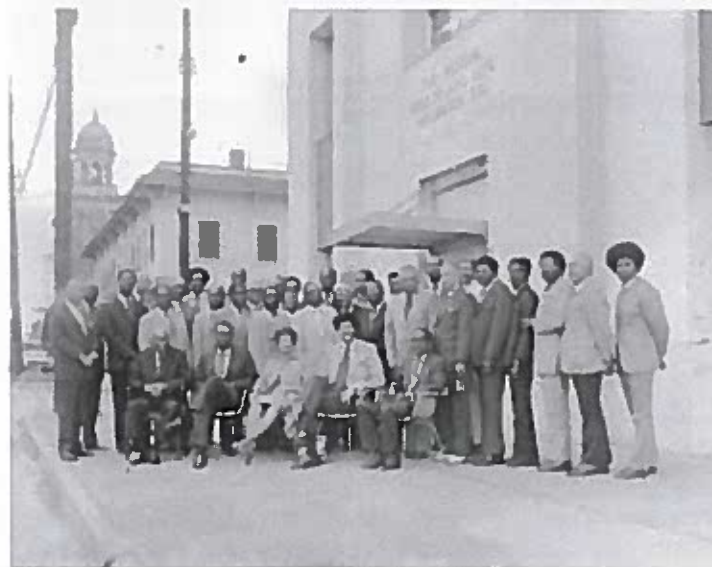
Employees of Pilgrim Health and Life Insurance Company pose outside of the Augusta home office in 1970.