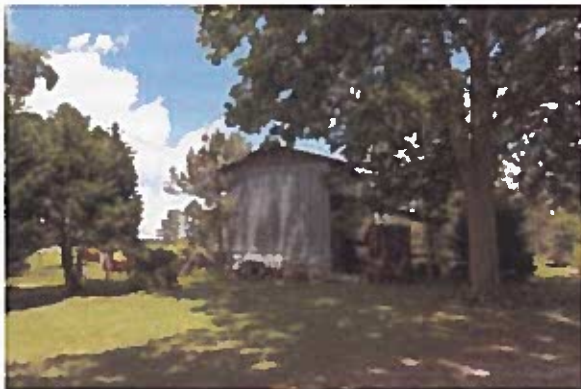
The tobacco barn still stands and is repurposed today.

The original farm house that was built in 1916 still remains today, but with important modern amenities like air conditioning and indoor bathrooms. Most of the historic outbuildings on the farm are gone, but the old tobacco barn still exists, though they stopped producing tobacco. The Williams family has lots of descendants today, so they built an enclosed pavilion with a large kitchen and seating area for family reunions, which are always held at the old homestead.