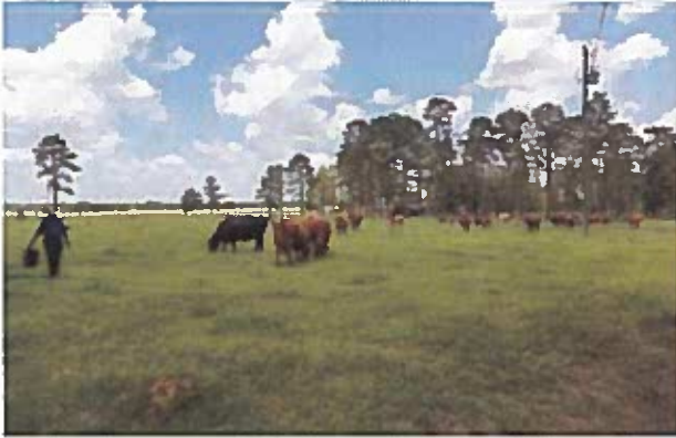
Feeding the cows is a daily chore on the Kentavia Williams Farm.