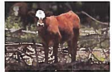
Cows graze in abundant pastures on the Kentavia Williams Farm.