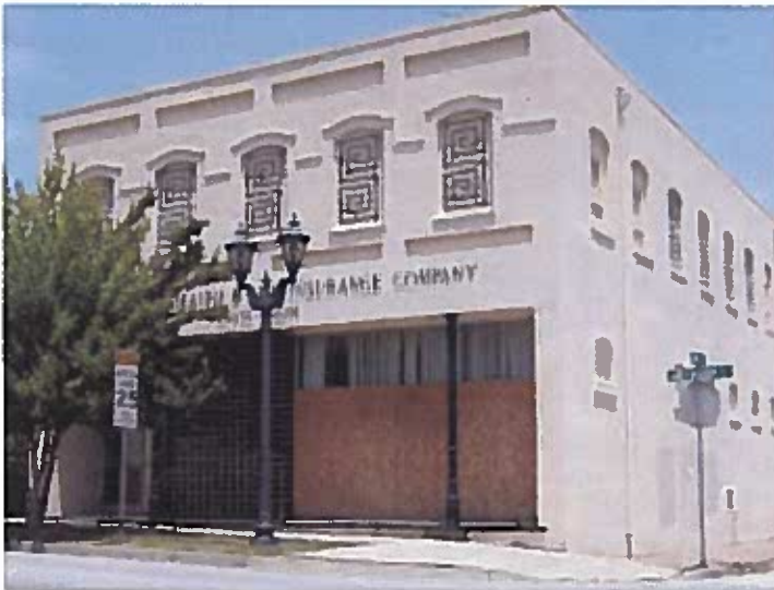
Pilgrim Health and Life Insurance Company is a contributing resource in the Laney-Walker North Historic District, listed in the National Register of Historic Places on September 5, 1985.

During the 1950s and 1960s, civil rights and desegregation began to take its toll on the insurance company and Pilgrim began to lose market share. Desegregation led to more white-owned businesses offering their services and variety of products to African-American consumers. After failing to create a surplus with their funds, Pilgrim was declared "Financially Impaired" in 1989. This declaration led to the acquisition of Pilgrim by Atlanta Life Insurance Company in that same year.