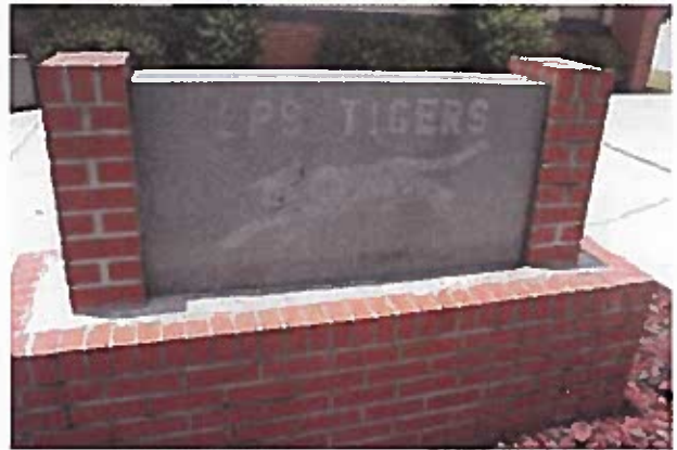
A Pinevale High School tiger is engraved on this marker that lies on the walkway between the gymnasium and the Pinevale Learning Center. These walkways were common on equalization school campuses, and provided shelter for the students as they moved between buildings.

Pinevale High School in Valdosta was one of nearly 500 equalization schools that were built during the 1950s-1960s when Georgia operated two racially separate school systems in response to the Brown vs. Board Supreme Court decision. Campuses of segregated schools in urban areas like Valdosta were common in communities with significant African-American population. These complexes included both an elementary and high school, athletic fields and, in some cases, gymnasiums and cafeterias that doubled as auditoriums. These schools became the center of the community, and sports teams exemplified this spirit.