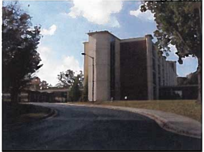
Holy Family Hospital was erected in 1962 and was renamed Southwest Community Hospital in 1975. This hospital that is presently vacant represents one of the last major efforts to improve health facilities for African Americans in Atlanta during segregation.

Morehouse School of Medicine was established in 1975 as the first 20 th century medical school for minorities in the United States. Louis Sullivan, a 1954 Morehouse College graduate, was the founding dean of the medical education program at the Morehouse School of Medicine. Sullivan served as secretary of the U.S. Department of Health and Human Services from 1989 to 1993 before returning to Morehouse School of Medicine to serve another term as dean from 1993 to 2002.