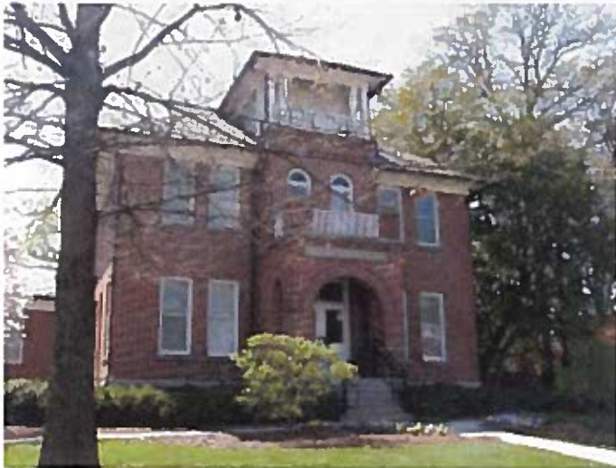
In 1896 the brick, Italianate style MacVicar Hospital became a training ground for Spelman's nursing students. Although the nursing program closed in 1928, the hospital was subsequently used as an infirmary for the Atlanta University Center. The building was renovated in the late 1990s and is currently the Health Services Center for Spelman College.

Medical education for minorities played a significant role in Atlanta, particularly within the Atlanta University Center. By the early 20 th century, Atlanta had become a hub for training black nurses and other healthcare professionals in Georgia at the Fair Haven Infirmary, the Gate City Drug Store, MacVicar Hospital, and Spelman Seminary. Beginning in 1886, Spelman Seminary (today known as Spelman College) is credited as starting the first nursing school for African Americans in the U.S. MacVicar Hospital, also known as McVicar, opened its doors to the public as a 30-bed hospital and training school on Spelman's campus in 1900. It was a training facility for Spelman College's nursing students.