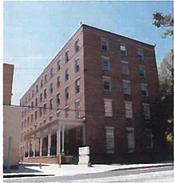
Piedmont Hall is currently used by the Morehouse School of Medicine for classrooms and a clinic.