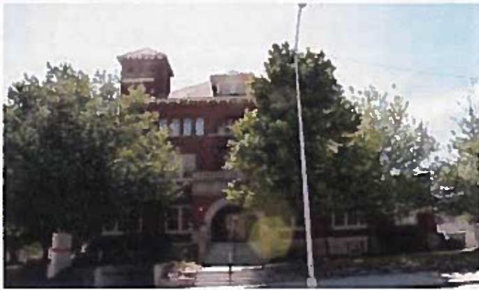
Human Resources presently occupies the Romanesque style Georgia Hall, a portion of Grady Hospital's original building.