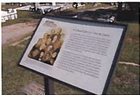
Outdoor panels provide comprehensive information at four stops along the cell phone tour routes at Oakland and South-View Cemeteries.

The exhibition consists of four outdoor panels that focus on African Americans interred at Oakland and South-View. These were: Geography of Race , a panel that describes slavery and Jim Crow practices that shaped the landscape of Oakland Cemetery;