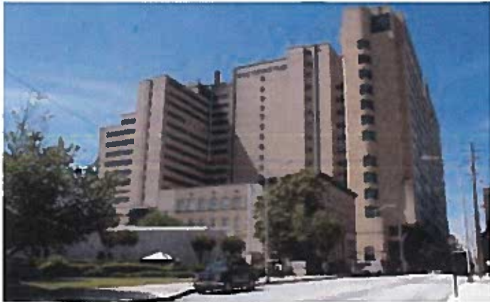
Today, the Grady Hospital complex is a public hospital that serves residents of all races who reside in Atlanta and Fulton County.