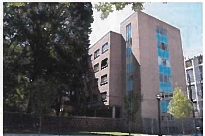
The International style Armstrong Hall, constructed in 1961, is currently being renovated.

There are two buildings formerly used as nurse's homes that remain on the former black side of the Grady Hospital campus. The first nurse's home was built in 1946 with $400,000 in federal funds provided from the Lanham Act. This building helped continue the nursing program threatened by inadequate housing and poor facilities. Robert & Company was the architecture firm employed to design the building to include an auditorium, laboratory, classrooms, and living quarters. The International style nurse's building was erected in 1961 at the corner of Armstrong Street and Piedmont Avenue. Both buildings have recently undergone rehabilitation. Today Grady Memorial Hospital continues its initial mission to serve all people regardless of race or status in the Atlanta area. ■