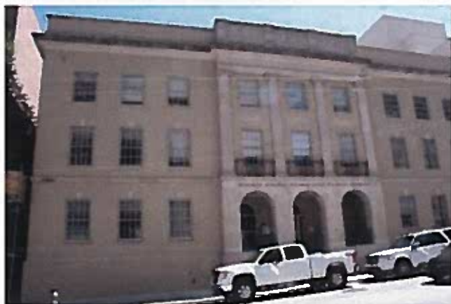
The 1917 J.J. Gray building is one of the few remaining buildings from the Emory Division of Grady Hospital for African American patients. Today, it is known as the Woodruff Memorial Research Extension.

By 1915, the former Atlanta Medical College complex located across Butler Street became Emory University School of Medicine and the City of Atlanta converted the buildings into a hospital for African American patients in 1917. The basement of the black hospital contained a large classroom, autopsy room, laboratories, and the medical school library and offices. The original Grady Hospital campus became known as the "white hospital" and the