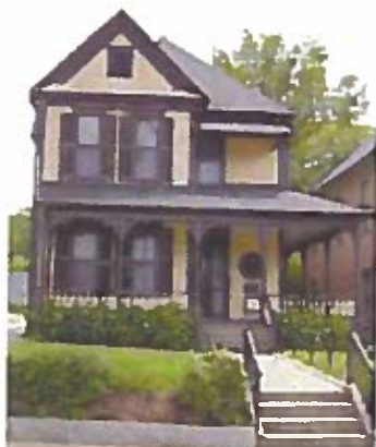
Thousands of visitors tour the birth home of Dr. Martin Luther King, Jr. in the National Historic Landmark District in Atlanta.

Atlanta is often referred to as the "Black Mecca." There is no other place where Black politics, education, business, religion, music and entertainment, and of course, the Civil Rights movement come together and define a place. But this is not limited to the Atlanta area. Throughout the state of Georgia, the African American experience is rich with stories, heritage and culture.