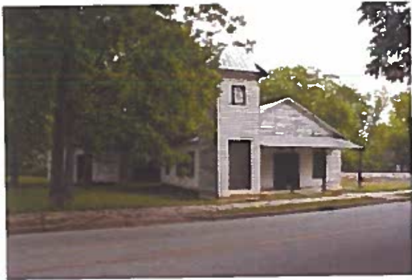
The Lone Star Benevolent Society Hall is a building that serves the residents of the African-American community in Waynesboro. These societies often provided burial insurance to families during segregation. The hall is located near Thankful Baptist Church.