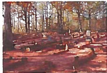
The grave mounding ritual is based upon West African spiritual beliefs.

Endsley (a.k.a. Ensley) family were slaves held in bondage on farms located in the area. After the Civil War members of the Endsley family purchased land and helped develop a local lumber industry. During the early 20 th century, members of the Endsley family migrated west to Los Angeles, California, and north to places such as Detroit, Michigan, in search of work and to escape Georgia's racist Jim Crow laws. By the middle of the 20 th century this rural black community had diminished in size considerably due to migration.