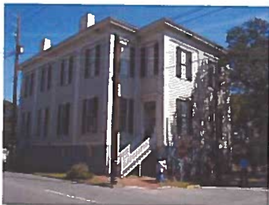
Beach Institute in Savannah is one of Georgia's historic African American schools that is featured in the guide. Today, Beach Institute hosts lectures and art exhibits.

Albany State University, Fort Valley State University, and Savannah State University are additional HBCUs. African American higher education in Georgia dates back to 1867 when Morehouse College was founded in the basement of Augusta's Springfield Baptist Church.