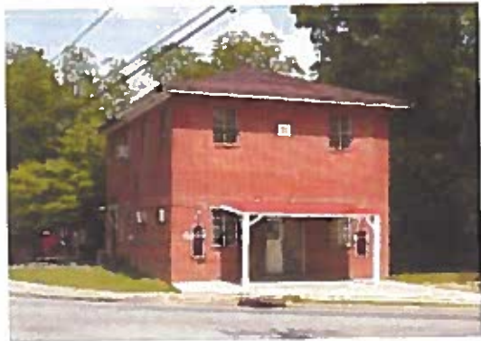
The Free and Accepted Masons, Prince Hall Affiliate Masonic symbol is located on the second level where the Masons meet while the lower level of the building provides commercial space.

buttresses and pointed-arched windows. The towers were originally open with supports for the steeply pitched roofs, but were covered with synthetic siding in recent years. The Thomas Grove Baptist Church was organized in 1870 and the present building was designed by George Bunn and constructed in 1908.