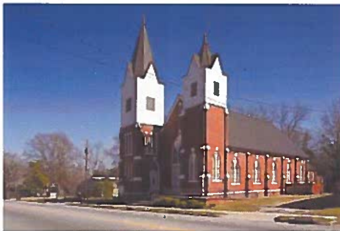
Thomas Grove Baptist Church was organized in 1870. This African-American church building was designed by George Bunn in the Gothic Revival-style. It was constructed in 1908.

Thankful Baptist Church is located at the intersection of Martin Luther King Jr. Boulevard and 9 th Street. Towers are located on