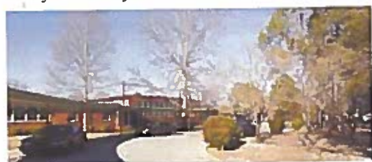
Blakeney Junior High School

As a response to the landmark U.S. Supreme Court decision Brown v. Board in 1954, Waynesboro, like so many other Georgia cities, began to construct new schools for African Americans that were part of a concerted effort to resist school integration. These schools were built with modern school technology to prove that separate schools for the races were indeed "separate but equal". In 1956, Waynesboro consolidated all African-American schools and built a new campus of buildings that were constructed across the street from the old industrial school. As school enrollment increased, the campus added several new International-style buildings. A series of covered walkways connect the buildings. When the Burke County school system was integrated in 1970, the elementary school became Blakeney Junior High School. The campus is still used by the school system today.