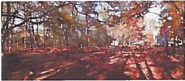
Basket Creek Cemetery in Douglas County near the Chattahoochee River was listed in the National Register of Historic Places on May 20, 2009.

Cemeteries are significant landmarks that reflect the shared cultural practices that bind people into communities. Sometimes the funerary rituals of a particular cemetery persist from one generation to the next forging a deep-rooted connection between the deceased and their descendants. The Basket Creek Cemetery is located approximately two miles northwest of the Chattahoochee River south of State Highway 166 in south Douglas County. Found in 1886, the site contains 110 known burials of African-American members of the Basket Creek Baptist Church. While thousands of cemeteries exist in Georgia, Basket Creek is distinctive because of its exceptional and rare grave mounds.