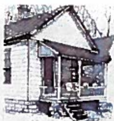
Georgia African American Historic Preservation Network

To get your copy of the Georgia African American Heritage Guide , please go to www.exploregeorgia.org or call 1-800-VisitGA. Fourteen Welcome Centers located throughout the state and Convention & Visitors Bureaus provide the guide as a service to heritage travelers. ■