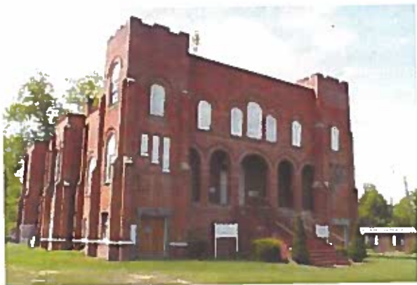
As Waynesboro's African-American population grew, black Baptists organized Thankful Baptist Church in 1878. The church survived two fires, and this brick building was erected in 1923.

both sides of the front façade of the brick building. Thankful Baptist Church was organized in 1878, and the church had two fires in its history. The current building was erected in 1923, but the church maintains two cornerstones that document a previous building that was destroyed by fire.