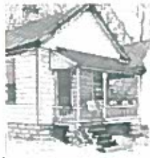
Georgia African American Historic Preservation Network

The Georgia African American Historic Preservation Network (GAAHPN) was established in January 1989. It is composed of representatives from neighborhood organizations and preservation groups. GAAHPN was formed in response to a growing interest in preserving the cultural and ethnic diversity of Georgia's African American heritage. This interest has translated into a number of efforts which emphasize greater recognition of African American culture and contributions to Georgia's history. The GAAHPN Steering Committee meets regularly to plan and implement ways to develop programs that will foster heritage education, neighborhood revitalization, and support community and economic development.