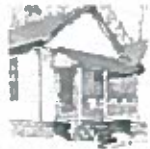
Georgia African American Historic Preservation Network

This publication has been financed in part with federal funds from the National Park Service, Department of the Interior, through the Historic Preservation Division, Georgia Department of Natural Resources. The contents and opinions do not necessarily reflect the views or policies of the Department of the Interior, nor does the mention of trade names, commercial products or consultants constitute endorsement or recommendation by the Department of the Interior or the Georgia Department of Natural Resources. The Department of the Interior prohibits discrimination on the basis of race, color, national origin, or disability in its federally assisted programs. If you believe you have been discriminated against in any program, activity, or facility, or if you desire more information, write to: Office for Equal Opportunity, National Park Service, 1849 C Street, NW, Washington, D.C. 20240.