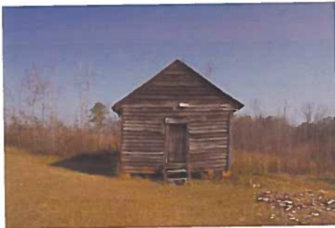
Historical documents and physical evidence point to a construction date of circa 1900 or earlier for the Bethlehem Baptist Church Colored School in Harris County.

The school is a simple 15-by-37-foot vernacular building with unpainted weatherboard siding and a stone chimney topped with bricks. Its foundation consists mostly of fieldstone piers, underpinning the log sills. The building has one wood door on front and three windows on each side. Tree saplings were used for joists to support the gable roof. There were never electrical utilities or plumbing in the building, and a fieldstone hearth is the only evidence of a heat source. Two painted black walls served as chalkboards. Four hand-made wood desk/bench combinations survive as a reminder of the young students who once occupied them.