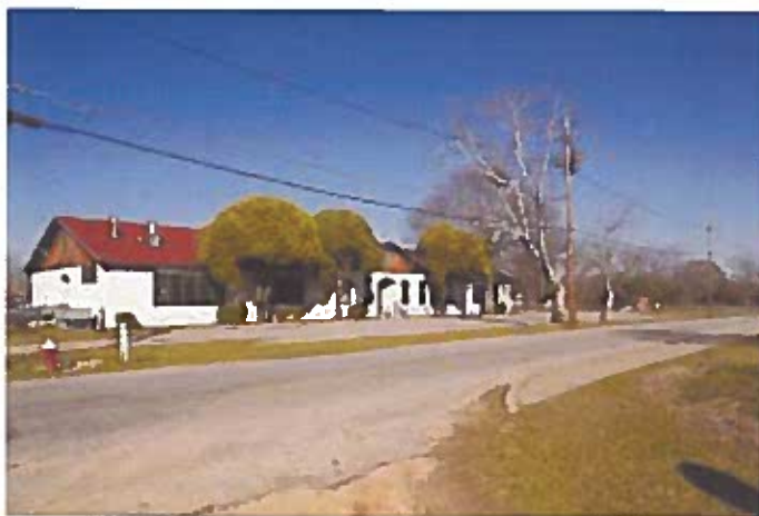
Waynesboro High and Industrial School is a contributing resource in the Waynesboro Historic District. The school building was constructed in 1920, and used as a school until 1955, when Blakeney Junior High replaced it as the African American community school.

Haven Memorial Methodist Episcopal Church building is an intact, wood-framed, mid-19 th century, Gothic Revival-style church. The architectural design is extraordinary compared to other African-American churches of that time. The high-pitched, front-gabled sanctuary has smaller cross gables and a corner tower with a front-gabled projecting entry. The enclosure consists of a brick foundation with exterior walls made of wood weatherboarding, painted white, and interior walls made of hand-grained wood paneling on the lower wall and plaster above. Also, there are pointed arch doors with stained glass windows. The church has a spacious sanctuary with center aisle and pews on either side. The pulpit is located on the western wall with an alcove lit by stained glass windows and a balcony with hand-grained wooden railing exists on the eastern wall. Notably, the Haven Church's original details include its plaster, vaulted ceiling, stained glass, pews and floors. Although Haven Academy is no longer extant, there is a small cemetery located on the 2 ½ acre site.