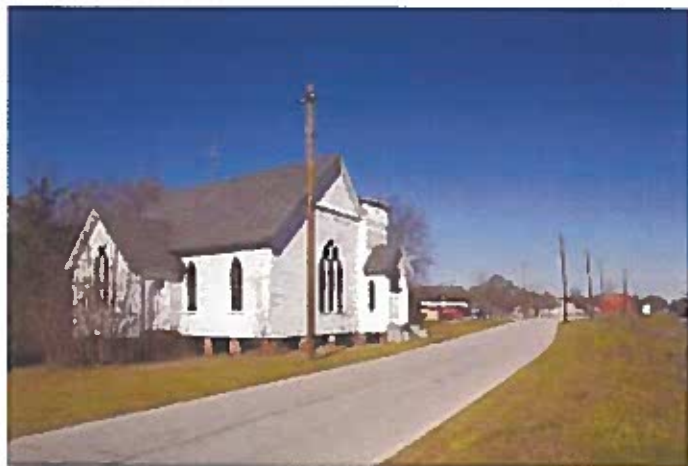
Haven Memorial Methodist Episcopal Church was constructed from 1888-1891. The church building sits on raised piers and is a wood structure with Gothic-Revival design features and stained glass windows.

In 1866, one year after the end of the Civil War, freedmen in Burke County gathered to begin a church. Two years later, Haven Academy, which functioned as a school and church site, was built. The school grew, so the church constructed a building adjacent to Haven Academy from 1888-1891. Haven Memorial Methodist Episcopal Church, now called Haven-Munnerlyn United Methodist Church, is located on Baron Street in Waynesboro. The church was listed in the National Register of Historic Places on April 12, 1996. Haven Memorial Methodist Episcopal Church is also a contributing resource in the Waynesboro Historic District.