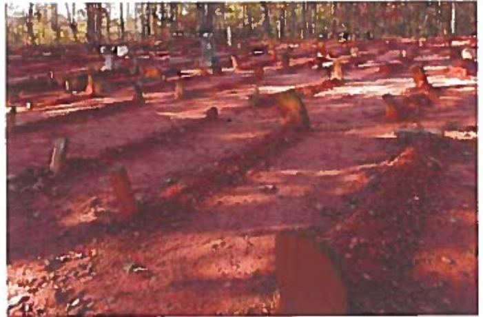
Members of the Basket Creek Baptist Church preserve the 110 burials in the cemetery by performing a mounding ritual biannually with descendants of the deceased.

Basket Creek Cemetery is the last remaining vestige of a turn-of-the-20 th -century African-American community located in south Douglas County. This rural black community consisted of single-family houses, saw mills, tenant farms, and churches situated within an area along the Chattahoochee River. Ancestors of the