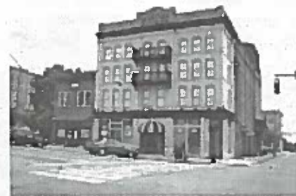
The Morton Building in downtown Athens provided office space for many African American physicians who lived in the Reese Street neighborhood.