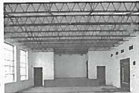
This room served as the school's auditorium and cafeteria.

After experiencing several problems related to funding and construction delays, the Martin Elementary School opened in September of 1956. For the next 14 years, the school served as the major educational institution for African American schoolchildren in the town of Bronwood as well as a central location for community gatherings. The school held classes for kindergarten through the eighth grade. While African Americans in Bronwood welcomed the new school, they continued to protest the injustices of racially segregated schools. Finally, in 1970, the Terrell County Board of Education integrated its local school district. Terrell County was one of the last counties in the state to desegregate its public schools. Integration was a major victory for local civil rights advocates, but the monumental change spelled the end for Martin Elementary. When most counties integrated they chose to close existing black schools and relocate its students to extant white schools. In Bronwood, the school closed in 1970 as its students were bused to a former all-white school located in the county seat of Dawson.