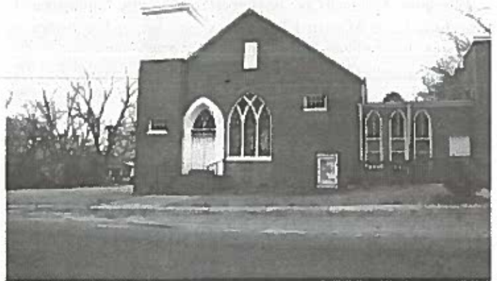
St. Paul Presbyterian Church is a community landmark building in the historic district.

Today, although some buildings are in poor condition, the Gillespie-Selden Institute continues to serve the community by hosting community events and providing youth activities and various services for the African American community of Cordele. The St. Paul Rural-Life Gillespie-Selden Community Center has