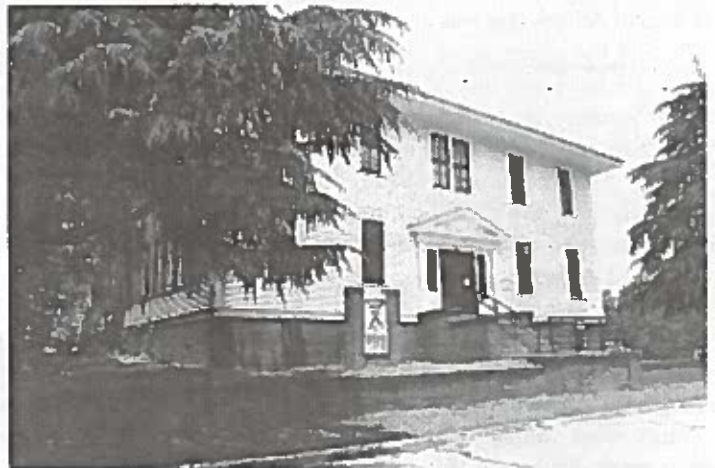
Athens High and Industrial School is a community landmark building in the Reese Street Historic District. The building is owned by the Athens Masonic Association, Inc.