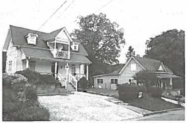
Some houses along Reese Street face a vacant lot where Knox Institute once stood.

Hancock Avenue. Kappa Alpha also purchased two historic houses that were adjacent to the fraternity house and subsequently demolished them in March 2007 for parking.