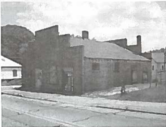
This building is one of the commercial structures in the Reese Street Historic District.