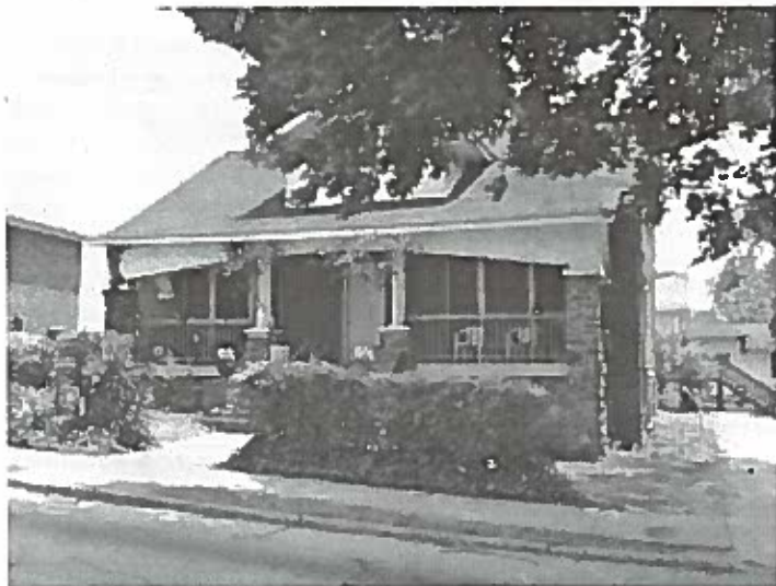
This house is a two-story structure that sits on a spacious lot in the Reese Street Historic District.

Over the ensuing 20 years since the district was listed, many community residents sold their houses or began to rent to students from the expanding University of Georgia campus. In 2006 the Kappa Alpha fraternity purchased an apartment complex in the district. At the time, Athens-Clarke County zoning regulations allowed fraternities and sororities to locate on multi-family zoned property. Since the acquisition, the county has passed an ordinance that makes fraternities and sororities a "special use" that requires a different process for such a move, but the ordinance was not in place at the time. The fraternity demolished one of three existing apartment buildings and built a new fraternity house on West