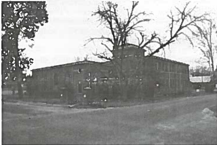
The administrative building is a contributing resource in the Gillespie-Selden Historic District that was listed in the National Register of Historic Places on December 2, 1998.

In State Fiscal Year (SFY) 2008, the St. Paul Rural-Life Gillespie-Selden Community Center in Cordele was among the recipients of a Georgia Heritage Grant when it was awarded $12,000 to complete its window restoration project. These repairs will allow the building to re-open and serve as a learning center with administrative offices and programs for the youth and senior citizens of the community. Repairs began in January 2008 and should be completed by the fall.