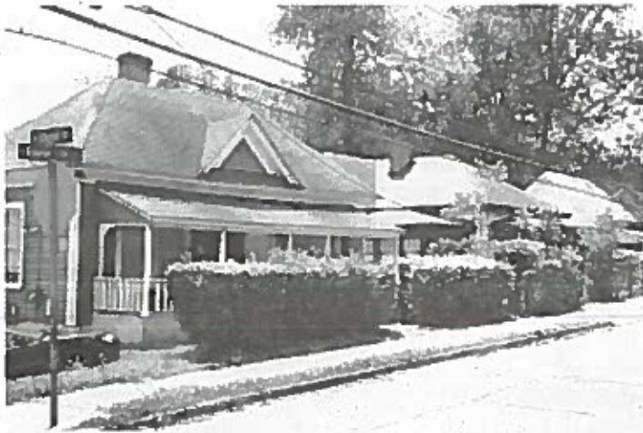
The Reese Street Historic District's residences represent eleven different Georgia house types.

While listing in the National Register of Historic Places achieved recognition by the National Park Service of the Reese Street Historic District's significance as an intact African American neighborhood, a local designation complements the National Register listing by implementing a design review process. This process ensures that future changes in the character of the district are approved before building permits are issued. The design review process also prevents demolitions unless necessary due to a building's condition.