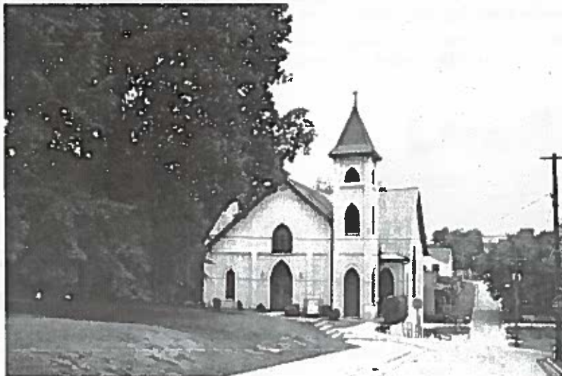
Hill First Baptist Church was built in 1893. The brick structure is a community landmark building in the Reese Street Historic District.