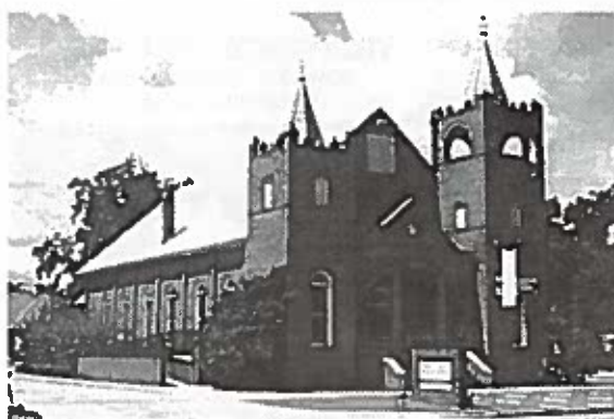
Mt. Zion Baptist Church was listed in the National Register of Historic Places on August 10, 1995. It is presently home to the Mount Zion Albany Civil Rights Movement Museum.

One such site that now serves as a Civil Rights museum is Mount Zion Baptist Church. Built in 1906, Old Mt. Zion Baptist Church served as the central gathering place for activists in Albany, Georgia during the Civil Rights Movement, and in 1961, it was this church that hosted the first mass meeting of the Albany Movement. Located in the historic Freedom District, the church is now the Mount Zion Albany Civil Rights Movement Museum and its mission is to commemorate the Civil Rights Movement and to serve as a local and national educational resource. During the movement, Old Mt. Zion's doors were opened to many an activist to protest against racial inequalities, including the Student Nonviolent Coordinating Committee (SNCC), the Southern Christian Leadership Conference (SCLC), the Congress for Racial Equality (CORE), and the National Association for the Advancement of Colored People (NAACP). Due to their historical significance, Civil Rights era buildings, structures and sites must be considered for National Register designation.