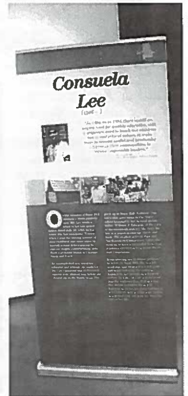
Each inductee in the SRBWI Hall of Fame is featured on stand-alone panels in the traveling exhibit.

In October 2007, curator Knight unveiled the 2005 Alabama HOF exhibit at a reception sponsored by the Birmingham Civil Rights Institute. The regional awards ceremony was held the following day at the Sixteenth