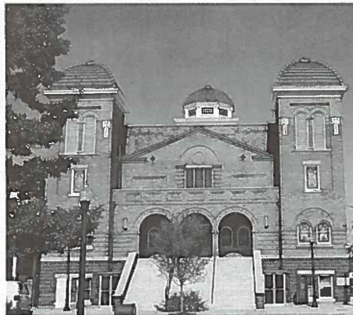
Sixteenth Street Baptist Church in Birmingham was the site for the Southern Rural Black Women's Initiative 2007 luncheon for the Hall of Fame project. This historic African American church was designated a National Historic Landmark on February 20, 2006 by the National Park Service.