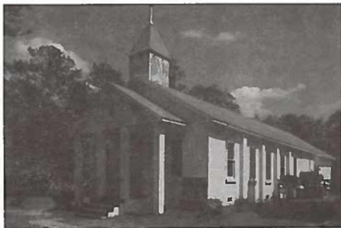
Evergreen Congregational Church was built by church members in 1928. Architectural features include a pyramidal-roofed cupola and a gable-roof portico supported by four posts.

Evergreen Congregational Church and School are located in Beachton, a southwest Georgia rural community in Grady County. Nestled south of Thomasville, Beachton lies near the Florida state line. Evergreen Congregational Church is a rare example of congregational churches that were built in Georgia during the first half of the 20 th century. The original church was organized in 1903 and was a frame building. It was demolished in 1925, and the new church was completed in 1928. It is built of concrete block and wood lath, and is distinguished by a gable-roofed portico and cupola. The church's sanctuary seats 250 people, and the one-classroom school is located in a separate building next to the church on a two-acre site.