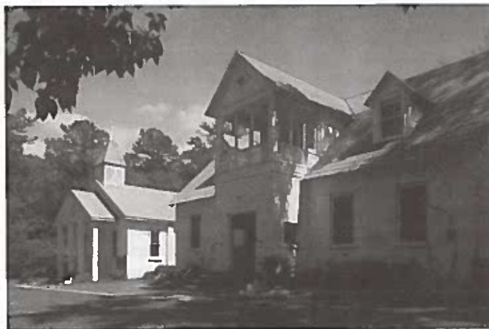
Evergreen Congregational Church and School were listed in the National Register of Historic Places on October 31, 2002. These landmark buildings are excellent examples of an early 20th century church and school complex in a rural African American community.

Andrew Young served Evergreen and Bethany until 1959. He would later become a leading aide for Dr. Martin Luther King, Jr., executive director of the Southern Christian Leadership Conference, and the first African American congressman from Georgia since Reconstruction. In 1977, Young was appointed U.S. Ambassador to the United Nations, and served as mayor of the City of Atlanta for two terms, and co-chair of the Atlanta Committee for the Olympic Games.