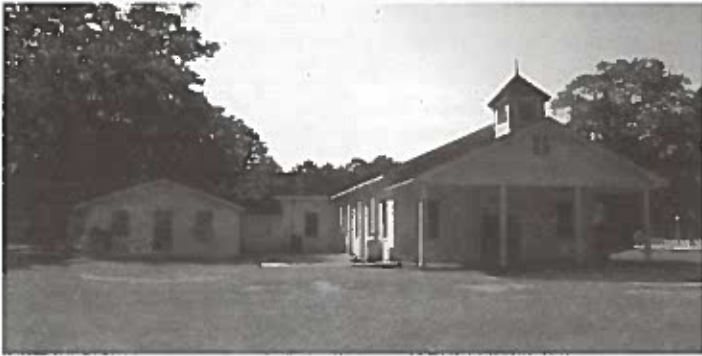
On Watch Night, the ring shout is performed in the annex of the Mount Calvary Baptist Church to bring in the New Year in Bolden.

The coastal ring shout was practiced by the enslaved population, albeit clandestinely, as plantation owners and missionaries discouraged the practice. Lorenzo Dow Turner explains in Africanisms in the Gullah Dialect that the word “shout” is a Gullah dialect survival of the Afro-Arabic saut , a fervent dance in Mecca. After prayer services, Gullah/Geechee descendants performed the shout in praise houses. Shout songs are different from spirituals or gospel music. Another distinguishing feature of the shout is that it is seasonal. When African Americans built churches after Emancipation, the shout was performed on Watch Night to bring in the New Year, and that tradition continues today.