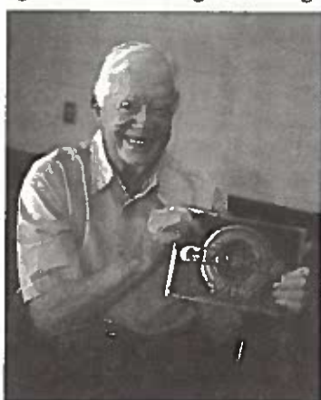
Former President Jimmy Carter received an honorary Centennial Farms plaque to commemorate his family farm in Archery.

Former President Carter discussed the importance of agriculture in Georgia's heritage.