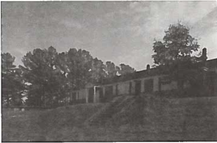
The circa 1934 Main High School is the central building on the campus. As enrollment grew, additional buildings were constructed on adjacent slopes. The Main High School campus was listed in the National Register of Historic Places on October 24, 2002.

In 1925, a two-room annex was added on the Main School property to reduce overcrowding. Additional grade levels were added in consecutive years from 1926-1930. By 1930, diplomas were given for the completion of the 11 th grade. In 1932, the school received accreditation from the Georgia Accrediting Commission and the Southern Association of Colleges and Schools. By that time, the school was known as Main High School. Twelfth grade classes were not available until the 1952-53 academic year.