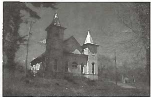
Bethel African Methodist Episcopal (A.M.E.) Church was listed in the National Register of Historic Places on May 9, 2002.

The First African Missionary Baptist Church hosted the General Missionary Baptists Convention of Georgia in 1909 and 1959. This historic church continues to be a community landmark building for African Americans in Bainbridge.