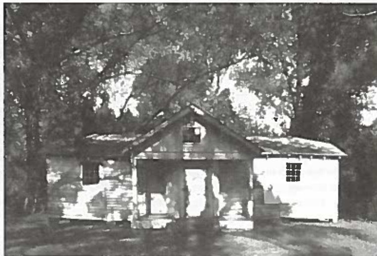
Newnan's Powell Chapel School is a rare example of an African American rural schoolhouse. As enrollment grew, a partition divided the one room into two classrooms for teaching grades one-seven.

Until the school closed in 1952 during consolidation, the Trustees of the Powell Chapel School continued fundraisers in the community to maintain the building. The Powell Chapel United Methodist Church occasionally uses the building for activities, but the trustees