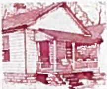
Georgia African American Historic Preservation Network

A 1921 school rally in Newnan illustrates the determination of African American parents to raise money for their children's education in the Jim Crow era.