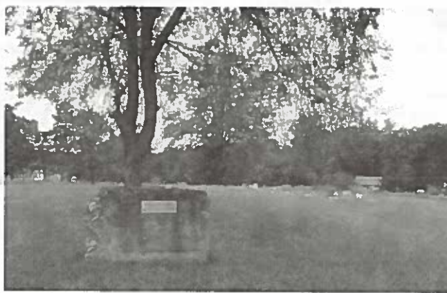
Paradise Cemetery was listed in the National Register of Historic Places on May 30, 2002.

P aradise Cemetery is located on a two-acre site northwest of the downtown square in Jefferson, Jackson County. This historic African American cemetery is the only remaining component of a complex that once included the 1919 Paradise African Methodist Episcopal (A.M.E.) Church, a parsonage, school, and two duplexes owned by the church. A large section of rock and concrete foundation from one of the churches that once occupied the site bears "Paradise A.M.E. Memorial Gardens" on a granite slab placed on one side of the foundation remnant.