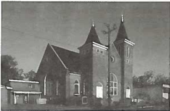
The First African Missionary Baptist Church in Bainbridge was listed in the National Register of Historic Places on January 28, 2002.

B ainbridge is the largest town in Decatur County and is the county seat of this rural area in southwest Georgia. Located north of downtown Bainbridge in a former residential area is the First African Missionary Baptist Church, a Romanesque Revival-style church surrounded by lumberyards, a funeral home and Oak City Cemetery. Construction for the brick church started in 1904, and by 1909 the First African Missionary Baptist Church was completed.