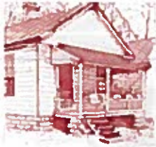
Georgia African American Historic Preservation Network