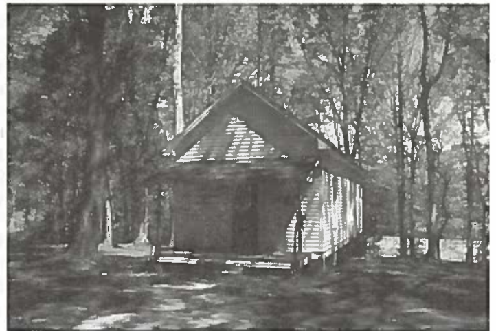
The Coweta County African American Heritage Museum and Research Center opened in April 2003 with financial assistance from the City of Newnan, corporate donations and sweat equity from the community.