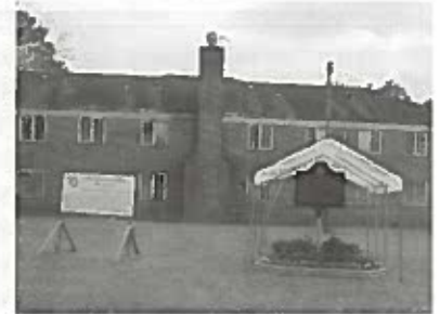
The Hubbard Alumni Association, Inc. dedicated a historical marker in April 2003 to commemorate the State Teachers and Agricultural College. The Women's Dormitory will be rehabilitated and used as an African American museum and cultural center.

The building was part of the historic campus of STAC, the official state-supported school for the instruction of African American teachers during the 1930s. The Georgia Board of Regents closed the school in 1939, and the