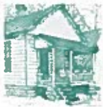
Georgia African American Historic Preservation Network

This publication has been financed in part with federal funds from the National Park Service, Department of the Interior, through the Historic Preservation Division, Georgia Department of Natural Resources. The contents and opinions do not necessarily reflect the views or policies of the Department of the Interior, nor does the mention of trade names, commercial products or consultants constitute endorsement or recommendation by the Department of the Interior or the Georgia Department of Natural Resources. The Department of the Interior prohibits discrimination on the basis of race, color, national origin, or disability in its federally assisted programs. If you believe you have been discriminated against in any program, activity, or facility, or if you desire more information, write to: Office for Equal Opportunity, National Park Service, 1849 C Street, NW, Washington, D.C. 20240.