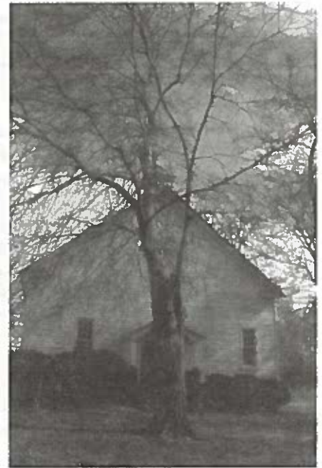
The old China Grove Baptist Church is located next to the Walter B. Hill Industrial School. A former principal’s father gave a sermon at the school once a week, and some current church members attended classes at the school.