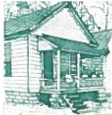
Georgia African American Historic Preservation Network

T he Georgia African American Historic Preservation Network (GAAHPN) was established in January 1989. It is composed of representatives from neighborhood organizations and preservation groups. GAAHPN was formed in response to a growing interest in preserving the cultural and ethnic diversity of Georgia's African American heritage. This interest has translated into a number of efforts which emphasize greater recognition of African American culture and contributions to Georgia's history. The GAAHPN Steering Committee meets regularly to plan and implement ways to develop programs that will foster heritage education, neighborhood revitalization, and support community and economic development.