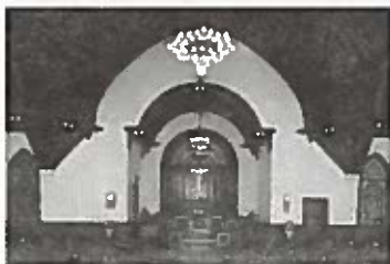
Interior design features include a vaulted ceiling and several stained glass windows in the sanctuary.

Architectural features of the church include two square entrance towers topped with tall pyramidal roofs and elaborate stained glass windows. Inside the church, 12 rows of curved pews are arranged in a semicircle surrounding the pulpit. A small brick addition was added shortly after the church was built behind the choir for the pipe organ and storage space. A wood lattice wall hides the pipe organ, installed in 1924-1925 in the apse behind the pulpit. The sanctuary's dark oak window and door surrounds and tongue-in-groove wainscoting contrast with the plaster walls. The vaulted wood ceiling is set diagonally in framed panels.