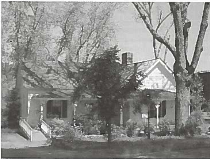
The Morgan County African American Museum received a $3,000 tourism grant from the City of Madison. This circa 1890 house museum promotes heritage tourism in Morgan County.

Madison is the county seat of Morgan County, established in 1809. Once a stagecoach stop, Madison maintains its historic central town square, anchored by the Welcome Center, City Hall, the Morgan County Courthouse and a U.S. Post Office. The Downtown Development Authority (DDA) was established in 1984 to revitalize Madison's downtown area. The DDA volunteer board provides leadership to ensure economic development in historic buildings complemented by beautification and streetscape initiatives. Restaurants and shops surround the square, and two African American historic buildings are located within walking distance of the square.