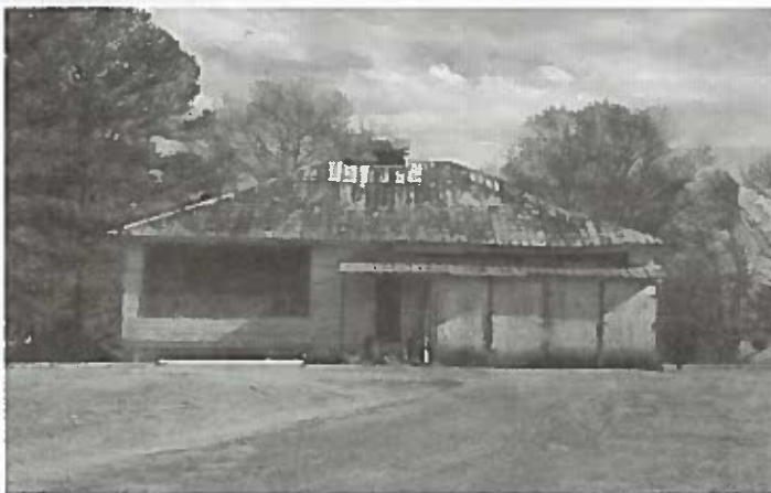
The Walter B. Hill Industrial School was named in honor of the Special Supervisor of Negro Education when it opened. In Georgia, the Rosenwald Fund provided grants for 242 school buildings during segregation. The National Trust for Historic Preservation listed Rosenwald Schools as one of America’s 11 Most Endangered Historic Places in June 2002.