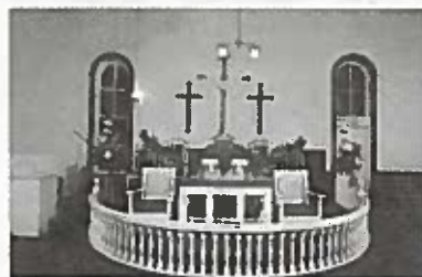
The pulpit's semicircular raised platform and balustrade are original interior design features in the sanctuary.

T he Bethel African Methodist Episcopal (A.M.E.) Church is a landmark building in Acworth, Cobb County. The Romanesque Revival-style brick church was constructed circa 1882. The church has a front gable roof and round-arched, four-over-four, double-hung windows and double entrance doors. Conical metal roofs nestle above the two church towers, and the original bell is retained in the south tower. The York Bell Foundry of Ohio manufactured the bell. A 1998 report revealed that this bell was probably original to the bell tower construction due to its large size and cast-iron material that were not manufactured after the turn of the century.