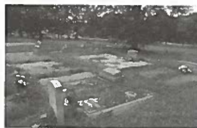
Beveled markers covered with large concrete slabs adorn burials in this section of Paradise Cemetery.