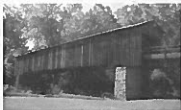
Euharlee Creek Bridge is the site of an annual covered bridge festival each Labor Day weekend.