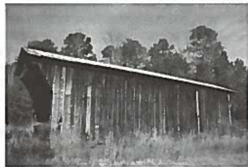
This section of the bridge that once spanned Wehadkee Creek in Troup County is preserved by stewards of the Ida Cason Callaway Foundation.

In Georgia today, two of Horace King's bridges remain. The Meriwether County Historical Society is the steward for the Red Oak Creek Bridge. The bridge was restored by the Georgia Department of Transportation and is open to foot traffic. Located in a community known as Imlac near Woodbury, it is appropriately accessible off "Covered Bridge Road" and connects to Georgia state highway 85. In 1965, the Wehadkee Creek Bridge in Troup County was soon to be immersed in water with the construction of the West Point Dam, and county officials donated a 60 th section to Callaway Gardens. The Ida Cason Callaway Foundation, a nonprofit organization, assumed stewardship of this historic resource. Though not currently available for public view, the foundation plans to incorporate the bridge as the gateway to a natural grass pasture reserve in its future development plans.