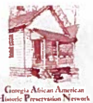
Photograph Not Available