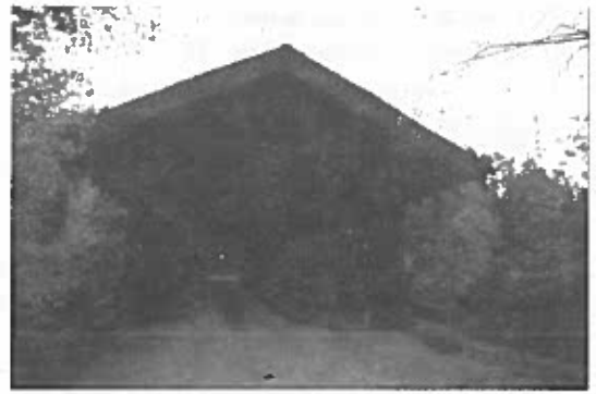
The Stone Mountain Park Bridge was once known as the College Avenue Bridge in Athens.