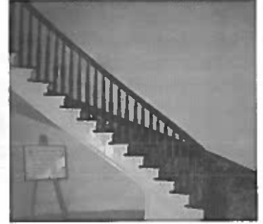
Horace King is credited with rebuilding this spiral staircase in the restored Alabama State Capitol.