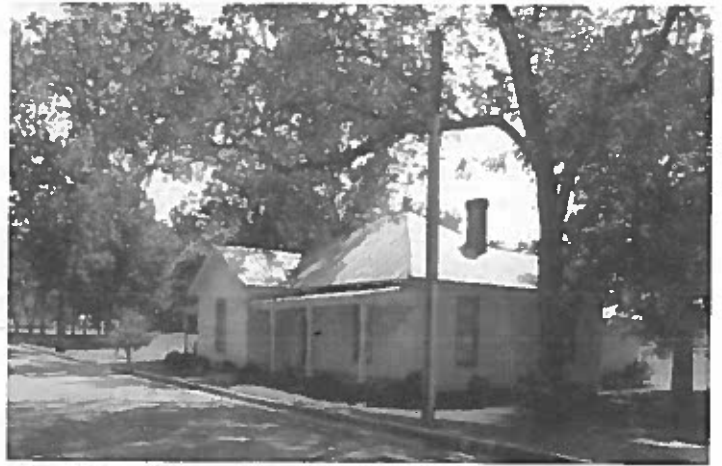
The Alfred and Jane Ables house was listed in the National Register of Historic Places on August 9, 2002.