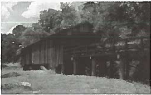
After the 1994 flood, a canoe paddled through the Red Oak Creek Covered Bridge. A plaque inside the bridge marks the water level.

After Godwin's death, Robert Jemison secured building contracts in Alabama for Horace King. Their largest venture was the construction of the (Bryce) Alabama Insane Hospital, built in Tuscaloosa in 1860. The hospital and the spiral staircase in the state capitol are the only existing historic resources built by Horace King in Alabama.