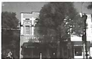
This art gallery on Lafayette Square in LaGrange, Troup County, was built by Horace King.