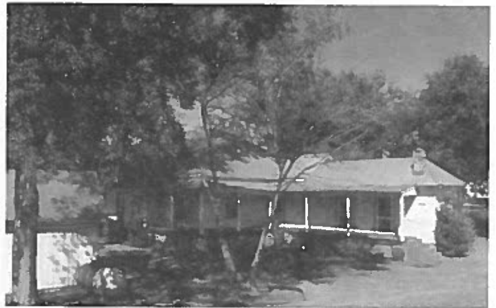
A wooden smokehouse is located about 15 feet from the rear of the house. Today it is used for storage.

In 1892, Alfred Ables built a one-story house with Folk Victorian details and a hipped roof for his wife, Jane, and their eight children. The Ables New South cottage is located alongside the Georgia Central Railroad line that links Columbus and Americus. Although this home style was typical for middle and upper-middle class white families, it was highly unusual for African Americans. Many of the original features of the house are still remaining, including four fireplace mantles, interior doors, and windows. An addition to the home is connected by a corridor, and includes a dining room and kitchen. The last family member lived in the house in 1978.