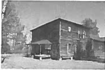
This view of the school shows the rear classroom addition.