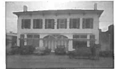
The Bridge House in Albany, Dougherty County, was listed in the National Register of Historic Places on November 19, 1974. A tunnel in the rear of the building connected the house to the Horace King bridge.