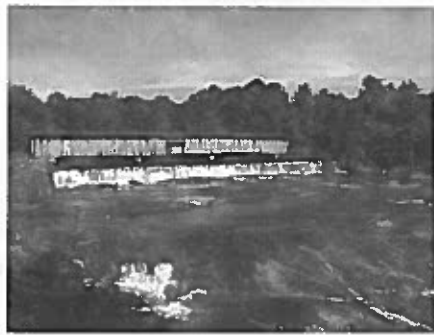
Watson Mill Bridge has the longest covered span of any existing wooden bridge in Georgia.