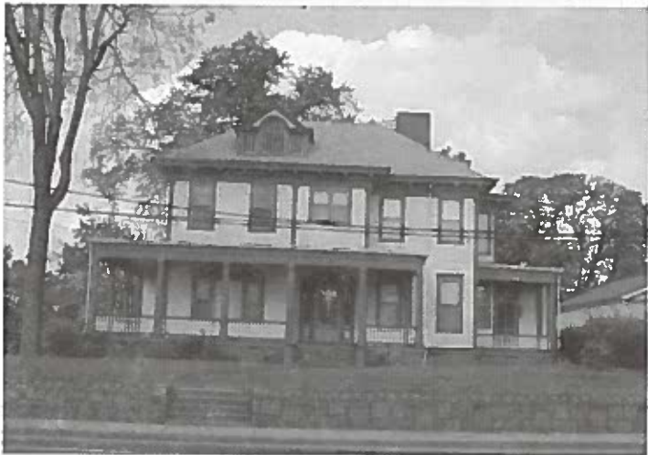
This home on Ralph David Abernathy Blvd. was a residence for nuns who served the parishioners of St. Anthony of Padua Catholic Church.

resources include: the Saint Anthony of Padua Catholic Church; a public library; the Fulton County West End Performing Arts Center; and, the Shrine of the Black Madonna Bookstore and Cultural Center.