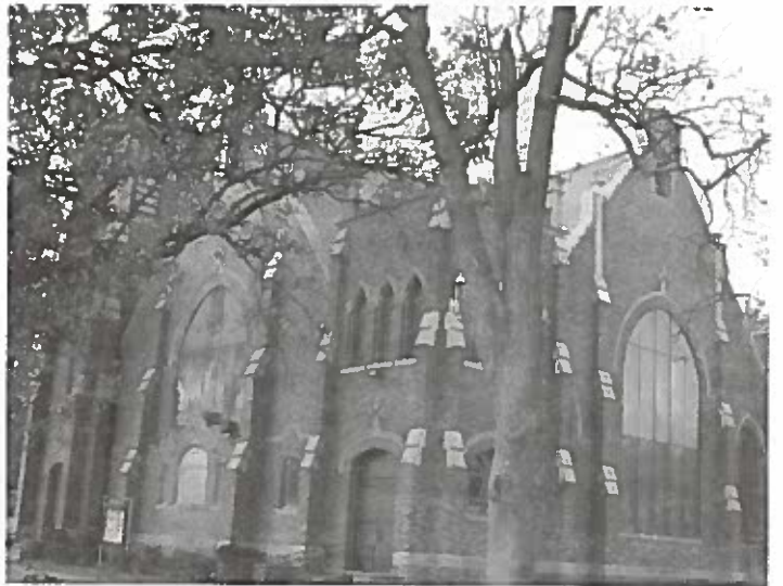
The Park Street United Methodist Church was constructed in 1912, and listed in the National Register of Historic Places on May 9, 1997. Clark Atlanta University uses this building for a music and art complex.

Like the initial visionaries of the White Hall Tavern in 1835 and the West End Village in 1868, the West End residents of the mid-1970s remain vigilant. We have a sense of time, place and history. We pledged to ourselves that we would reshape our West End neighborhood’s economic, social and cultural patterns. WEND is working with developers to shape a perspective and understanding that the Black college campus and neighborhoods that surround it are “living cultural records of post-bellum America.” WEND is educating developers to preserve the built heritage and consider projects that compliment public memory and built heritage.