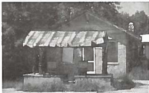
The community store provided supplies to Springfield farmers and was a meeting place for evening social activities.