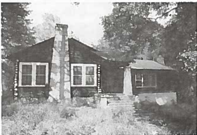
Piney Rest is the cottage that provided lodging for faculty who taught at the school and the Camilla-Zach Country Life Center.