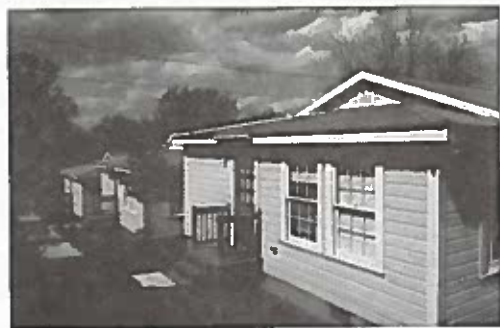
In 1996, the current owner rehabilitated these homes and qualified for the tax incentives program of the National Park Service.

The houses are six, very similar double shotgun homes built back-to-back in two rows, three facing Barber Street and three