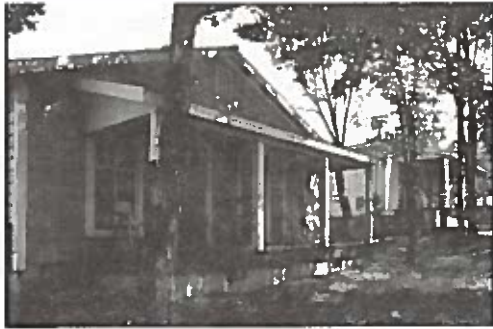
The vernacular architectural style of Brightwell Shotgun Row is similar to houses in the Caribbean and Africa.

In the late 1800s, Athens was the site of an African American residential area known as New Town. This community evolved to meet the housing needs of workers from the emerging railroad line and other industries in the region. While the railroad helped to establish the African American community, it simultaneously separated the white southern neighborhood from