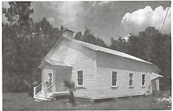
New Ogeechee Missionary Baptist Church was listed in the National Register of Historic Places on August 8, 2001.

New Ogeechee Missionary Baptist Church is located in Burroughs, a rural African American community southwest of Savannah in Chatham County. A cupola covers the iron church bell in the wood-frame building. This place of worship was the site for baptisms, weddings, funerals, and church services.