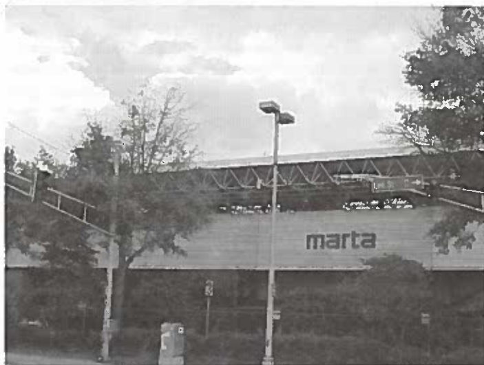
The area surrounding the West End MARTA station will incorporate smart growth strategies to encourage commercial development and sustain the historic integrity of the West End Historic District.

The ARC-LCI promotes quality growth by encouraging greater mobility and livability “within” employment and town centers. The LCI program encourages communities to develop innovative ways to deal with growth. Objectives of the ARC grant include: reducing reliance on single-occupant automobile trips; promoting a balance between housing and employment; enhancing the commercial/residential village’s historic identity; and encouraging pedestrian mobility. The city is encouraging land use