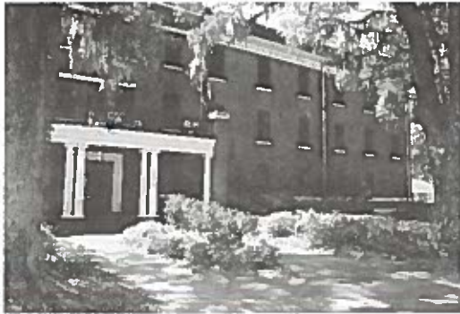
The Camilla Hubert Hall dormitory was built at Georgia State Industrial College to provide housing for women during the presidency of Benjamin F. Hubert.