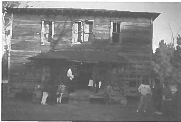
Constructed in 1924, the Alapaha Colored School is located in the northern portion of Berrien County. This wooden schoolhouse is an example of a rural school constructed to educate African American students. The town of Alapaha was awarded a $37,000 Georgia Heritage grant to stabilize and restore the building. When completed, the school will be used as a town library, community meeting center, and masonic lodge.

For State Fiscal Year 2002, a total of $500,000 has been appropriated for the Georgia Heritage Program to provide matching grants for development and predevelopment projects. Development projects include stabilization, preservation, rehabilitation and restoration activities. Predevelopment projects include plans and specifications, feasibility studies, historic structure reports, or other building-specific or site-specific preservation plans. The maximum grant amount that can be requested is $40,000 for development projects, and $20,000 for predevelopment projects.