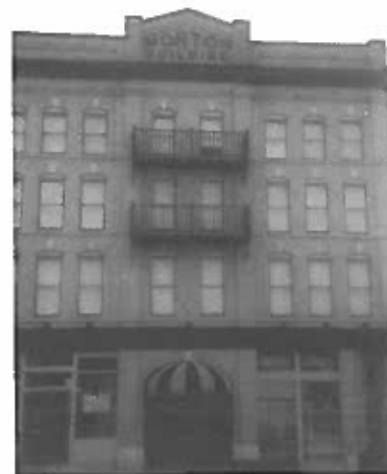
The Morton Building features businesses on the ground level. Double doors providing access to the Morton Theatre are on the left.