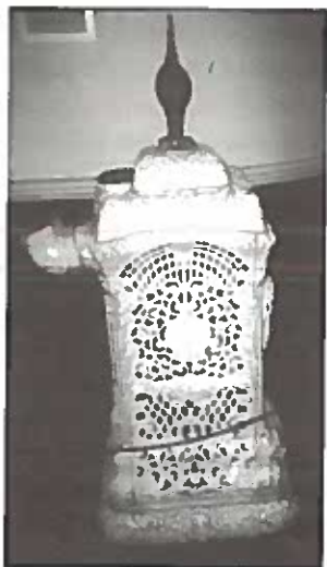
The Morton Theatre's original, cast iron "pot belly" stove.