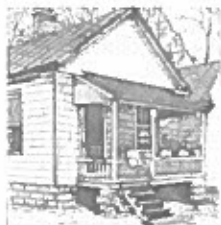
Georgia African American Historic Preservation Network

The Georgia African American Historic Preservation Network (GAAHPN) was established in January 1989. It is composed of representatives from neighborhood organizations and preservation groups throughout the state. GAAHPN was formed in response to a growing interest in preserving the cultural and ethnic diversity of Georgia's African American heritage. This interest has translated into a number of efforts which emphasize greater recognition of African American culture and contributions to Georgia's history. The Network meets regularly to plan and implement ways to develop programs that will foster heritage education, neighborhood revitalization, and support community and economic development.