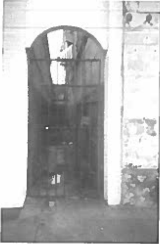
A steel gate to the left of the theatre's main doors was the entrance for African Americans during segregation.