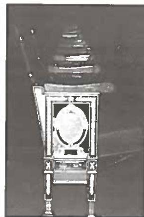
The Liberty Theatre's original seats bear contributors' names on brass plates.

Gertrude Pridgett "Ma" Rainey performed in all African American theatres in Georgia. This drawing, featuring her image and home, was featured in a Columbus Convention & Visitors Bureau poster series.