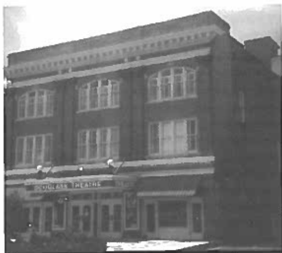
The Douglass Theatre, in downtown Macon, reopened in 1997, and hosts movies, music and stage productions.

The Douglass Theatre is located in Macon, Bibb County, in the Macon Historic District, listed in the National Register of Historic Places in 1974. Charles H. Douglass, an African American entrepreneur, founded the Douglass Theatre in 1921. During the Jim Crow era, there were no theatres accessible to African Americans in Macon. Douglass recognized the need for a