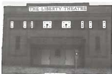
The Liberty Theatre is located in Columbus. This historic building is managed by the Liberty Theatre Cultural Center, Inc.