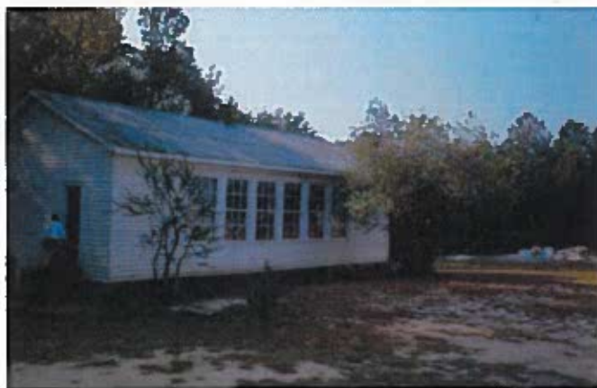
Green Grove School is an example of a one-room school typically used to educate African American students in early 20th century rural Georgia. The windows provided a natural light source in this wood frame building. The school is presently used for church functions, special classes and family reunions.