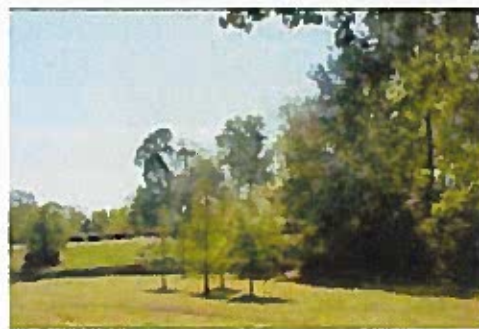
Washington Park is the focal point in the community for recreation. In 1919, Washington Park became Atlanta's first park for African Americans.