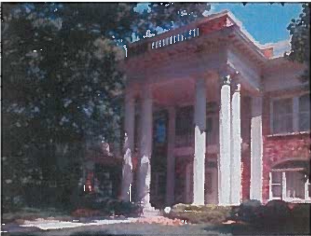
Visit The Herndon Home, 587 University Place N.W., in Atlanta. Tours are conducted hourly from 10 a.m. to 4 p.m. Tuesday through Saturday. Admission is $5 for adults, and $3 for students. Group rates are available. For group tour reservations and further information, call 404-581-9813.

As an African American male from rural Georgia, touring this historic property left me in awe of every aspect of the home, including its structure, furnishings and landscape. Be sure to tour this grand historic place next time you are in Atlanta.