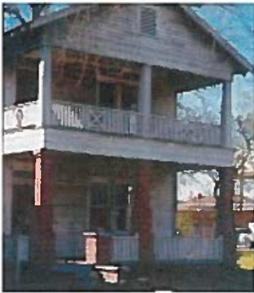
The home of Gertrude Pridgett "Ma" Rainey was listed in the National Register of Historic Places in 1992. Born in Columbus in 1886, Rainey began her career traveling the minstrel circuit with her husband. "Ma" Rainey incorporated country blues and jazz in her performances in African American segregated theaters throughout the South. Her legacy influenced legendary blues singers Billie Holiday, Bessie Smith, and Ethel Waters. "Ma" Rainey is known as "the mother of the blues."

The Columbus Black Heritage Trail recently received a National Recreation Trail designation from the Department of the Interior. Thirty properties along this urban concrete trail document African American heritage in Columbus, including the home of Gertrude Pridgett "Ma" Rainey and the former site of the Dillingham Bridge, built by Horace King, a former slave. Other properties along the trail include the Liberty Theatre and the William H. Spencer House. The Columbus Black Heritage Trail, Muscogee County, is the second African American trail to receive this designation, following the Carter G. Woodson Black History Trail in Washington, D.C.