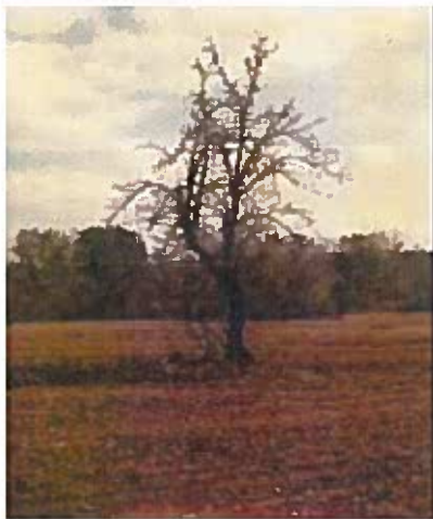
A pear tree on the Lewis Clark farm in Boston.

Following the Civil War, most African Americans worked as tenant farmers on former white-owned plantations or migrated to industrial cities. Carole Merritt reported in Historic Black Resources , "landownership has come hard to African Americans, particularly in southern states like Georgia. By 1900 only one in seven black farms was operated by owners, and only one in five acres of farmland in the state was black-owned." The Georgia Historic Resources Survey documented fewer than ten African American-owned farms in 38,000 properties. The accomplishments of these three families are extraordinary, given the historic economic barriers they surmounted to acquire farms, produce crops, and maintain the land within their families for over 100 years!