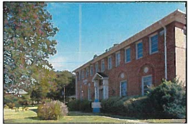
Carnegie Hall, c. 1925, was built with a $25,000 contribution from the Carnegie Corporation. The building was the campus library until 1952. Carnegie Hall is presently used as the campus safety office and commuter student lounge.