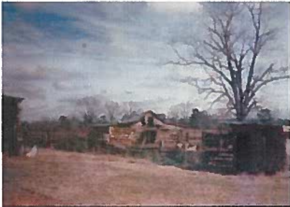
The Morgan family farm historic outbuildings include a smokehouse, cotton barn, hog pen, mule barn, corn crib, and hen house.