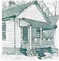
Georgia African American Historic Preservation Network

T he Georgia African American Historic Preservation Network (GAAHPN) was established in January 1989. It is composed of representatives from neighborhood organizations and preservation groups throughout the state. GAAHPN was formed in response to a growing interest in preserving the cultural and ethnic diversity of Georgia's African American heritage. This interest has translated into a number of efforts which emphasize greater recognition of African American culture and contributions to Georgia's history. The Network meets regularly to plan and implement ways to develop programs that will foster heritage education, neighborhood revitalization, and support community and economic development.