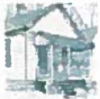
Georgia African American Historic Preservation Network

This publication has been financed in part with federal funds from the National Park Service, Department of the Interior, through the Historic Preservation Division, Georgia Department of Natural Resources. The contents and opinions do not necessarily reflect the views or policies of the Department of the Interior, nor does the mention of trade names, commercial products or consultants constitute endorsement or recommendation by the Department of the Interior or the Georgia Department of Natural Resources. The Department of the Interior prohibits discrimination on the basis of race, color, national origin, or disability in its federally assisted programs. If you believe you have been discriminated against in any program, activity, or facility, or if you desire more information, write to: Office for Equal Opportunity, National Park Service, 1849 C Street, NW, Washington, D.C. 20240.