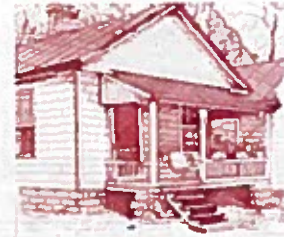
Georgia African American Historic Preservation Network