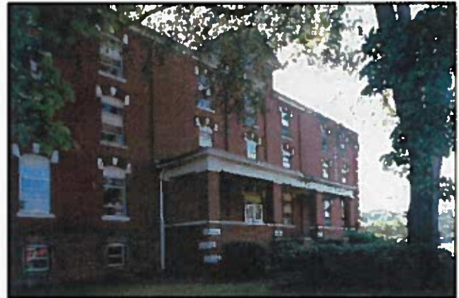
Huntington Hall, c. 1908, was a gift from C.P. Huntington. The building was utilized as a dormitory for girls. It is the oldest building on campus, erected with the assistance of student laborers.