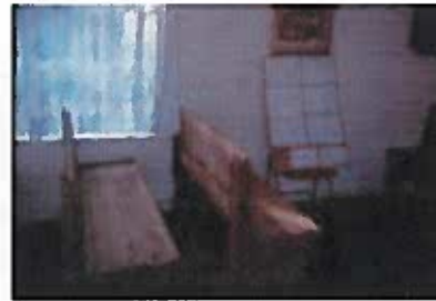
Inside the Green Grove School are the original benches for students and displays of their class projects.