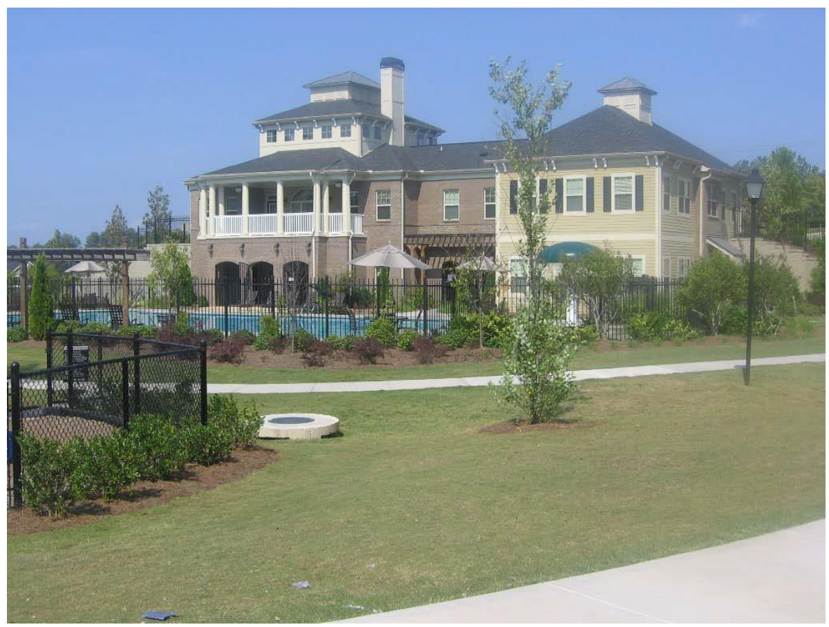
Acceptable Community Building Exterior