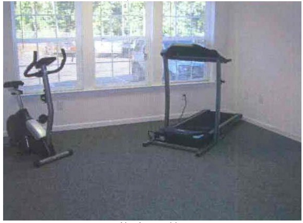
Not Acceptable Equipment is used and not commercial grade. There is not enough equipment for the size of the complex.