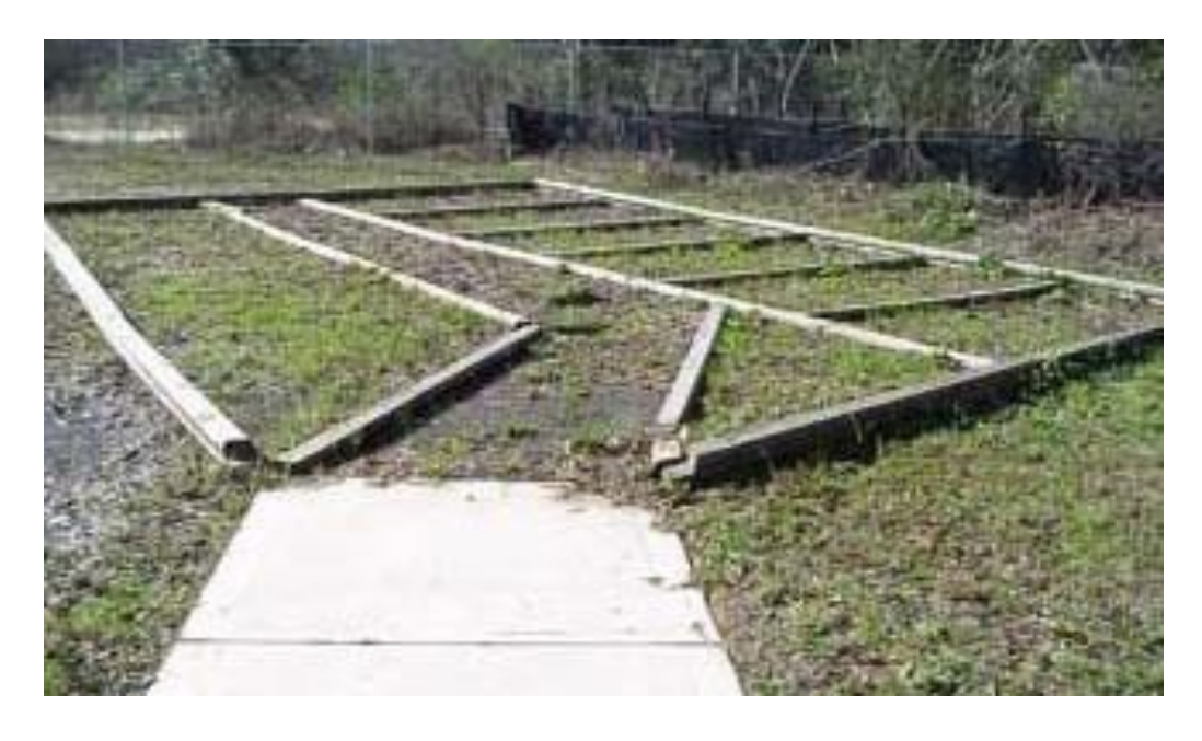
Not Acceptable No fence; overgrown with weeds.

The garden beds are elevated to an accessible height, each plot has a water source, and the plots are on an accessible path.