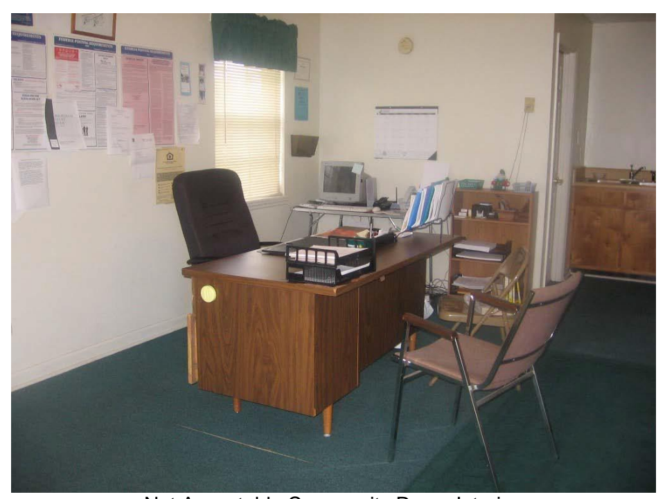
Not Acceptable Community Room Interior

The property manager's office must be separate from the community room.