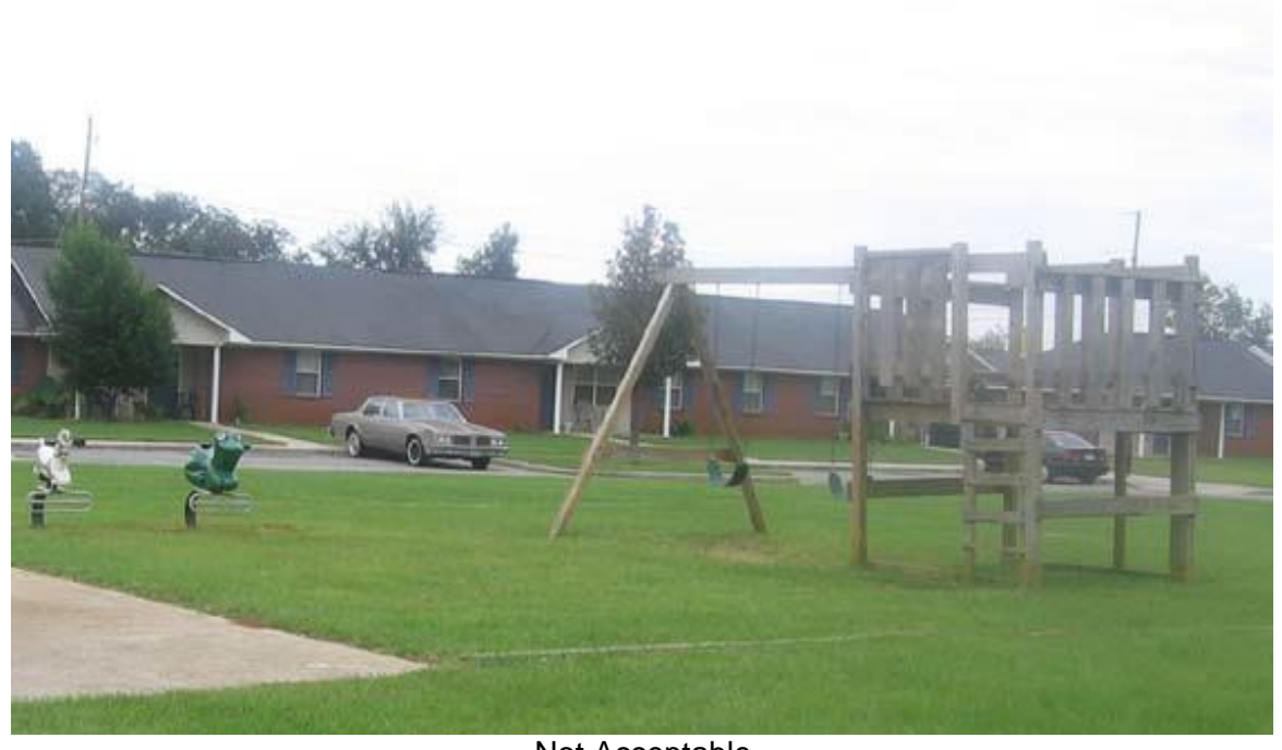
Not Acceptable Equipment not constructed in compliance with CPSC guidelines for materials, ladder handrails, or ground cover. There is no observation bench.