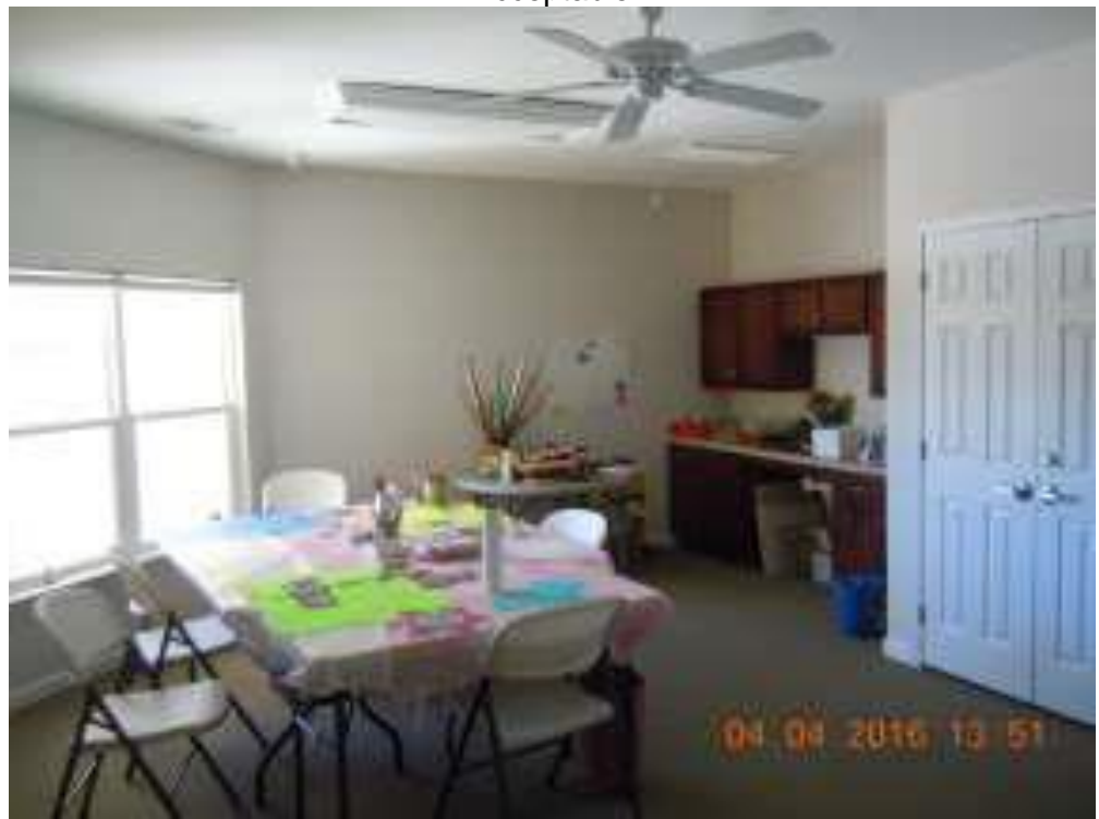
Not Acceptable Uninviting room without decorations and use of folding furniture and table