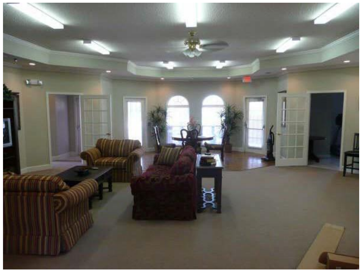
Acceptable Community Room Interior