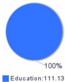
Table1: MSYs by Focus Areas